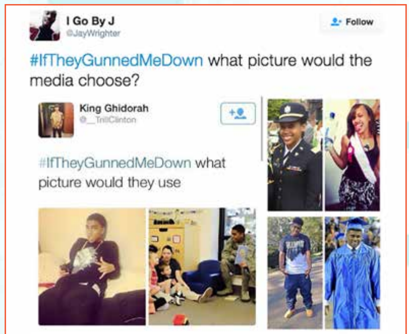
Figure 1. Responses to negative media portrayals of young African American men.