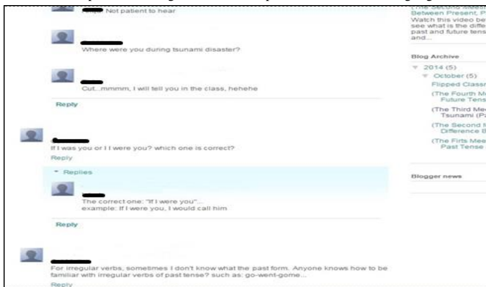
Figure 3 Students' online interaction on the Blog outside of the class times

In term of interaction, most students acknowledged that the flipped classroom instruction could help in establishing a good interaction with peers in the classroom and after the class hours. While in the class activities, students could interact through face-to-face groups working together and while outside the class hours, they could interact online on the Blog by asking and answering questions. In this case, problem-solving and exchanging ideas were not only established through face-to-face during the class hours but also online outside of the class. The survey result also revealed that 85% ( M = 4.14 , SD = .863 ) of students declared that the flipped learning instruction enhanced students' peer interaction among students in-class and out-of-class times. Also, 81 % ( M = 4 , SD = .733 ) of students believed that using a Blog made them easier to interact with the others outside of the class. Observation on the Blog also shows that students actively interacted with peer to exchange idea and solve problem, see the following Figure 3: