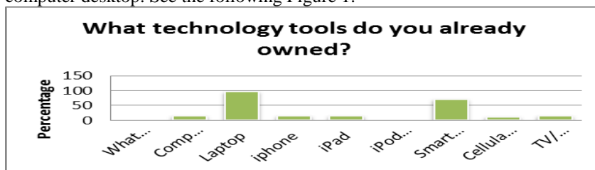
Figure 1 Technology deviced owned by college students

Checklist question reported that most students were familiar and already owned diverse technological tools such as computer desktop, laptops, Smartphone, iPhone, and iPads. It designated that 96 % students have owned a laptop, 70 % Smartphone, and 14 % computer desktop. See the following Figure 1: