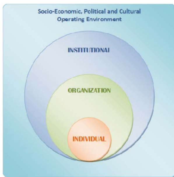
Figure 1: Interaction of the different levels of capacity. Adapted from UNDP (2008, p. 7)