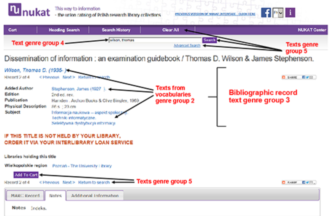
Figure 1: Polish national union catalogue genre groups. Some texts not circumscribed

integrated library system. Cooperating libraries are obliged to update downloaded data (if necessary), add their library identifiers to union catalogue records they download, and place a link to the union catalogue website on their library webpage.