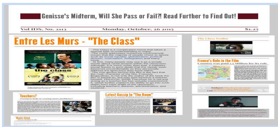
Figure 1. Interactive collage (Benjo & Scotta, 2008)

The following figure is an illustration of student use of variety of modes using web-based tools to share knowledge of discrimination in schools (racism, colorism, 'othering'). This example incorporates student reflection, links to videos and webpages, and images to illustrate a deep understanding of the course material (See Figure 1).