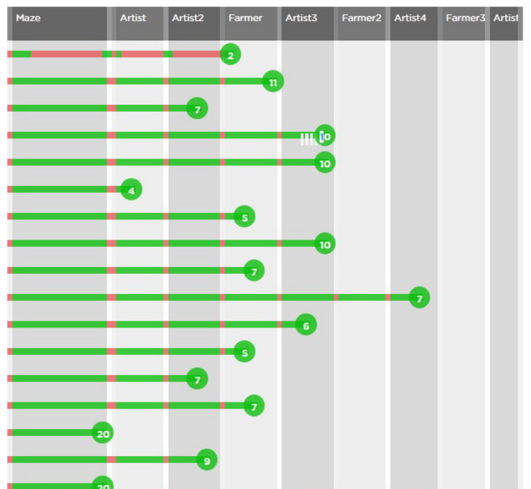
Figure 1. Students' progress