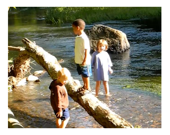
Figure 1. Children exploring the river and the natural environment at a state park.