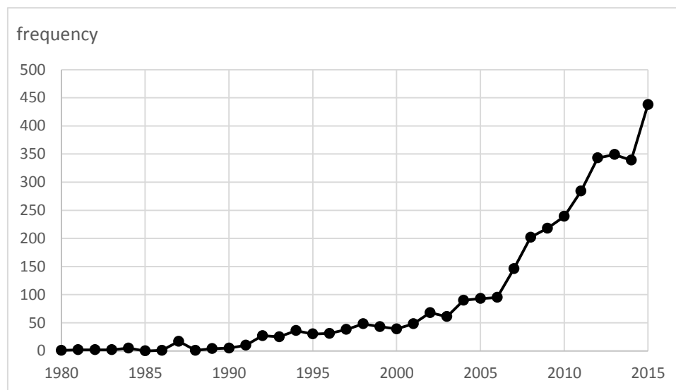
Figure 1. Annual distribution of 3458 articles

As part of this study, the keyword of “Action Research” was searched in the database of Web of Science in the category of articles (as of April 3, 2016), and the annual distribution of a total of 3458 articles can be seen in Figure 1.