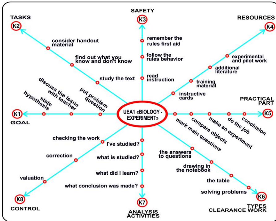
Figure 2. Logical-semantic navigator 'BIOLOGY- EXPERIMENT'