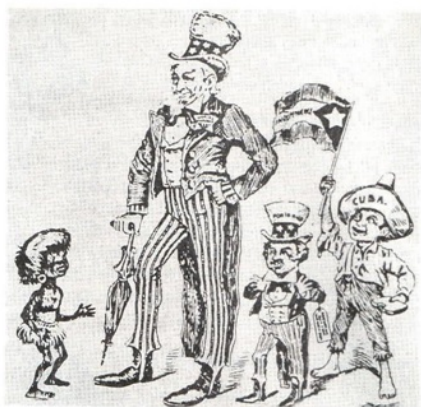
La caricatura representa la actitud de dominio de los Estados Unidos frente a filipinos, puertorriqueños y cubanos.

At the same time, the written and visual text of Milenio 8 asks readers to consider the motivations and implications of the US to construct its own national identity on the backs of colonization and imperialization in other places, such as Puerto Rico, Cuba, and the Philippines (see Figure 3).