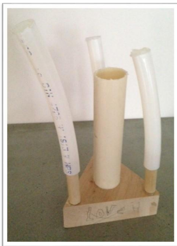
Figure 4. Construction with plastic pipes.

The resources which have been introduced in teaching prescribe different kinds of activities. Some include explicit instructions for procedural activities that students and teachers are expected to carry out together, but often the activities are implicit in the sense that they naturally follow from the introduced resource. A teacher that shows a PowerPoint slide expects the students to listen to the presentation while reading from the slides. When a film clip is shown, the students are expected to watch it. One procedural activity is an exercise called “The other way round”, which involves students suggesting and making a list