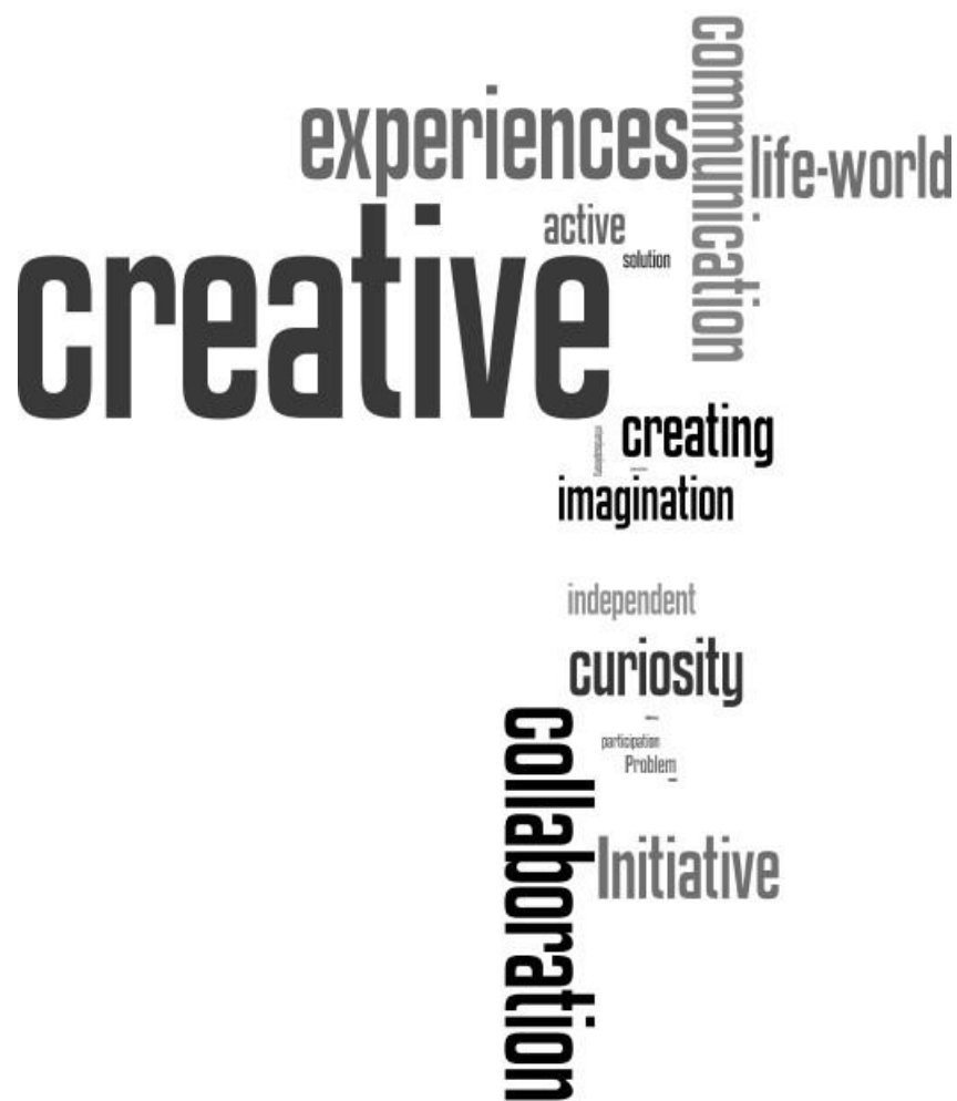
Figure 5. Word cloud representing salient content of the primary transformation unit; Didactic design 2.

We may ask what particular meanings regarding creativity are being put forward here; what specific aspects of creativity are represented? In the case of the construction with plastic pipes (Fig. 3 and Fig. 4) and the Easter card (Fig. 2), the message seems to be that there are certain ways of working in class that will develop children’s creativity. In the first case, creativity involves realising a product or a construction. However, choosing colours from a wide range of options is not regarded as creative. Both examples are clearly related to developing an idea of some sort, out of one’s motivated interest, but only one is regarded as being “entrepreneurial”. The idea of deciding in advance what creativity is, and the kinds of processes or ways of working that will lead to creativity, appears to be problematic. One may argue that creativity is something unpredictable and that creative processes can be very diverse.