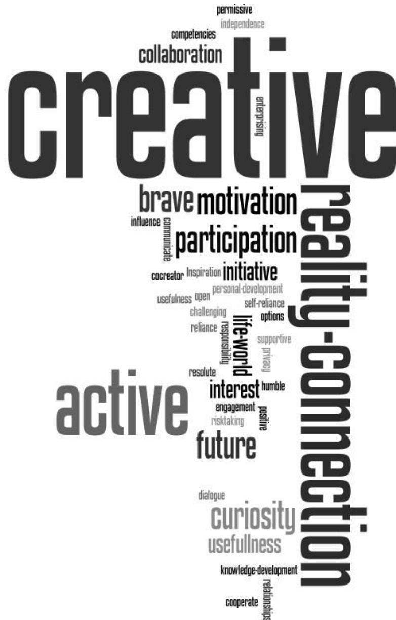
Figure 5. Word cloud representing salient content of the setting; Didactic design 1.

The results show that creativity is an important notion within an entrepreneurial approach. The two word clouds ( http://www.wordle.net/ ) below are an illustration of our results. The word clouds show the words that are most commonly used in the texts; the size of the words in the cloud illustrates how often the word occurs in the texts; the bigger the word, the more often it is used. The word clouds thus help us to interpret and illustrate what is highlighted as being significant in the texts (cf. Mc Naught & Lam, 2010). Creativity is the word that is the most salient in both the teachers' texts and the students' texts.