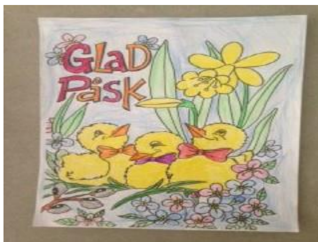
Figure 2. Easter card with drawn chickens and flowers.

The images that have been selected (Fig. 2, Fig. 3 and Fig. 4) and inserted into the teaching material have been analysed in terms of form . The notion of creativity appears in the PowerPoint presentation as essential, and two images are put forward as examples of how teachers may stimulate pupils’ creativity. The first slide contains an image of an Easter card with drawn chickens and flowers that has been coloured by someone – probably by a pupil (Fig. 2). Our interpretation is that this card is presented as an example of a material and a way of working that does not give pupils much scope to be truly creative. The motif is already chosen, and what remains for the students is “only” to choose colours and to fill in the card. The next PowerPoint slide represents, in our interpretation, an example of the ways of working that will allow pupils to be creative, to develop an idea or a design which will be realised as a product or construction (Fig. 3 and Fig. 4). There are two images. The first is a construction drawing with a list of instructions, the materials needed for building and the selling price. The second image is a photo of the realised product. It consists of plastic pipes on a raw wooden base. The drawing and the product are made by a pupil.