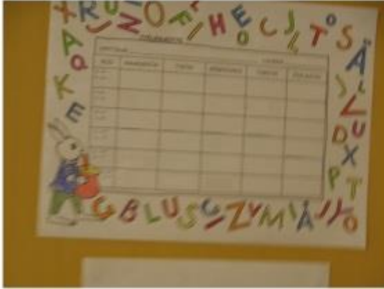
Figure 7. I don’t have any influence on what we do in school.