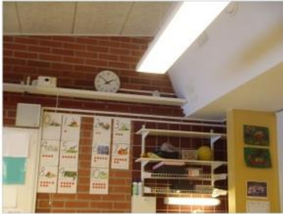
Figure 5. I would like to learn how to read the time better.