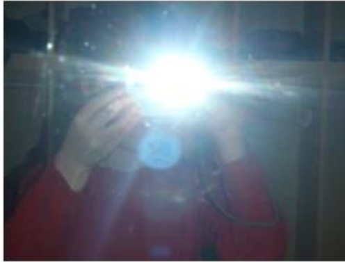
Figure 4. I bring myself a happy feeling.