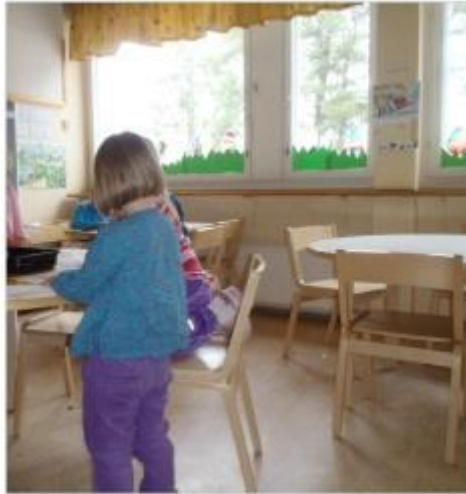
Figure 6. I have an influence on what I do.