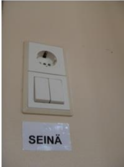
Figure 2. I am able to reach higher.

Our second example features Laura (a preschooler), who had taken a picture of a light switch in the daycare center, as she explains the story behind the photo. In addition to this photo, she had taken photos of bookshelves and her locker to demonstrate what she was capable of reaching.