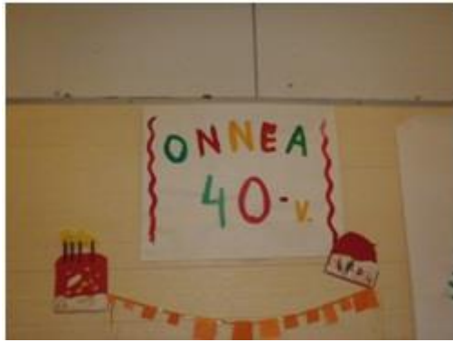
Figure 1. I can do a similar piece by myself.