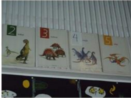
Figure 3. At school I can write numbers correctly.