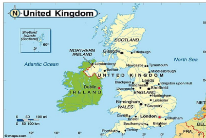
Figure 3: The geographers' presentation

The historian talks about the main monuments and a description of a festivity, focusing on what citizens usually do on that particular day.