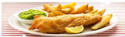
Figure 5: The gastronomes' presentation

The entertainment researcher speaks about cultural aspects such as music, bands and other important celebrities born there.