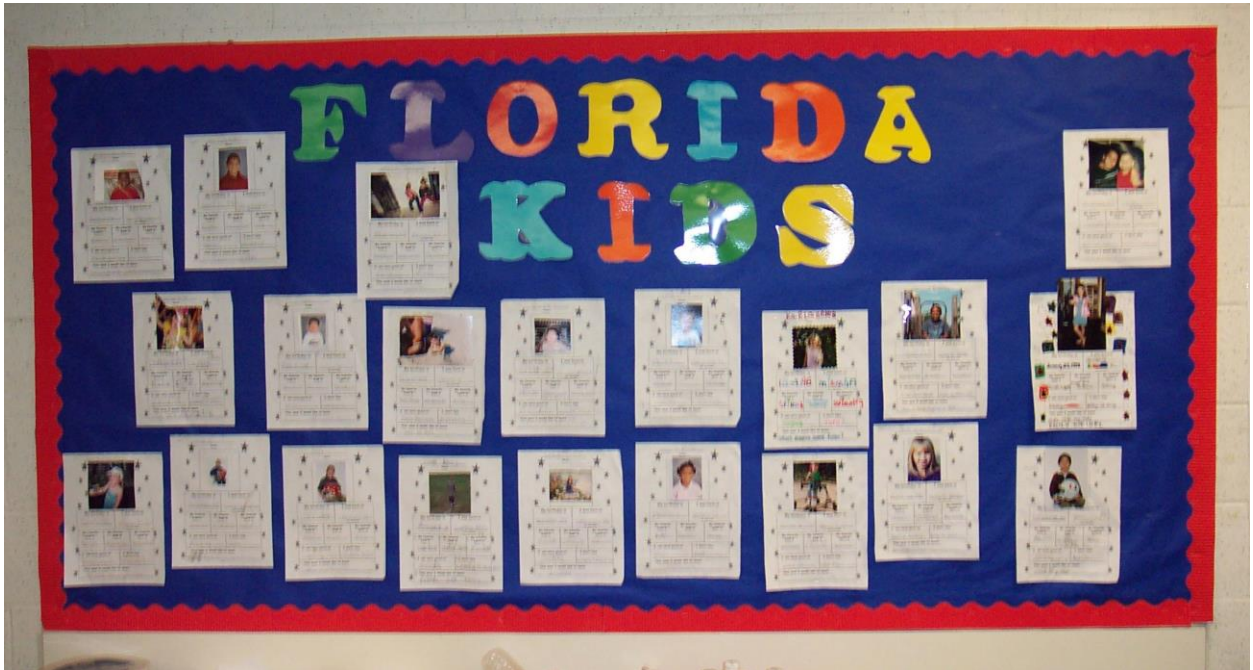
Figure 3. The Florida Kids bulletin board.

The story above offers a brief glimpse at the morning routines and classroom environment of the Cooperation Crew, a team-taught multi-age class consisting of students traditionally labeled as kindergartners, first graders, and second graders. The purpose of this article is to share the results of a qualitative research project initiated to characterize the qualities of multi-age instruction for a group of homeroom teachers and an art teacher at a specially selected school site, with the intention of describing the congruities and incongruities in their instructional practices and organizational strategies.