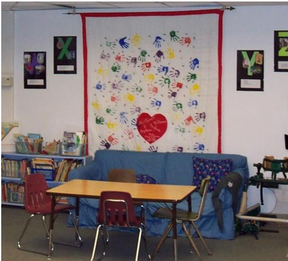
Figure 1. The Cooperation Crew quilt.

I found the quilt displayed in a central classroom (see Figure 1) that connected to three other rooms (see Figure 2) used by a group of students collectively known as the Cooperation Crew. I entered the door labeled with Mrs. Barnes' name, and found students standing in a circle, singing to morning music, and offering friendly greetings to one another. The class was diverse in a number of ways, with a fairly even mix of cultural diversity, but also with an unusually obvious height differential between some students. As the music finished, students sat down on the floor and Mrs. Barnes settled them into their morning routine.