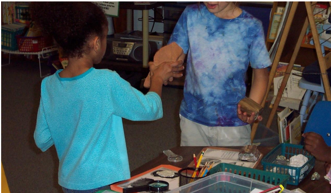
Figure 4. Group work during a learning center activity in the subject area of science.

During my observations in the multi-age homerooms, I noted many instances when students would teach or assist peers during large table work. Student collaboration was most evident during learning center activities that featured predetermined groups working with manipulatives in subject area tasks (see Figure 4), or on Wednesdays when the Cooperation Crew had Club Day . For Club Day , students were presented with a variety of options for topic-related group activities that were organized by family members of Cooperation Crew students. During my observations, the club groupings available to the Cooperation Crew related to paper dolls, Asian cultures, music, cooking, construction, art, and gardening. Clubs were reorganized on a monthly basis, and were unique to the Cooperation Crew as the other teachers at Minco Elementary had not implemented such activities in their weekly schedules.