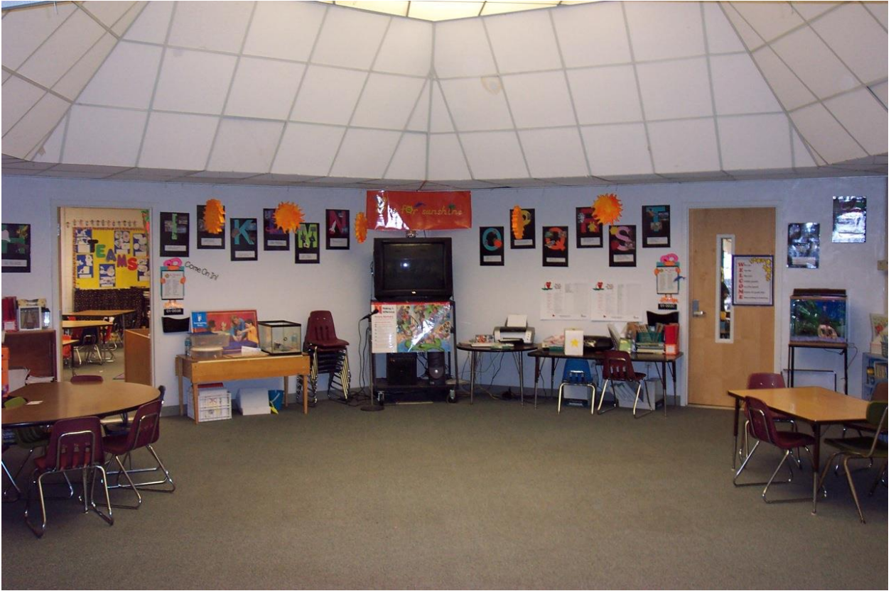
Figure 2. The central classroom, with doors leading to Mrs. Barnes' and Mrs. Glenda's class spaces.

I took a glimpse at all three classrooms that were homes to the Cooperation Crew, and quickly noticed several commonalities: each classroom featured students with noticeable height differentials, and none contained isolated desks placed in traditional rows. Instead, larger tables were used to reinforce group interaction. In Mrs. Kahan's room, a colorful bulletin board with the title, "Florida Kids", caught my attention. The display featured individual photographs of students mounted on worksheets that required responses to autobiographically-framed questions (see Figure 3). A quick scan of the answers revealed interesting information, especially to those not familiar with the organizational structure of the Cooperation Crew. The birth dates of the students spanned a range of three or four consecutive years, and nowhere on the bulletin board did it mention the assigned grade levels of any particular student.