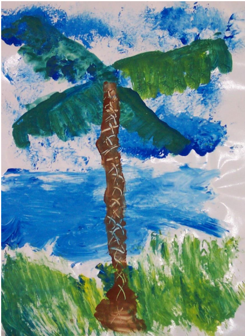
Figure 6. A sample for the Florida Highwaymen project.