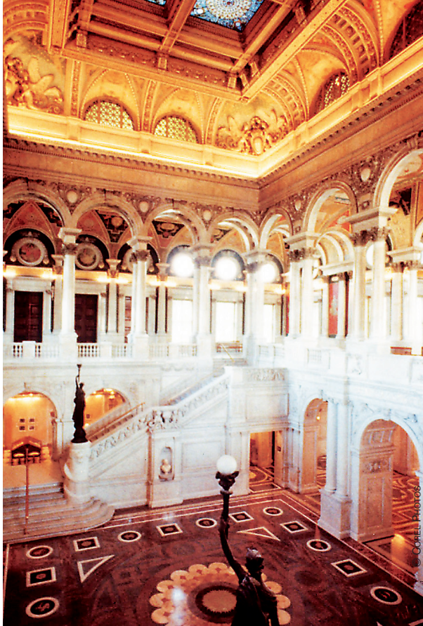
The Great Hall of the Jefferson Building of the Library of Congress.