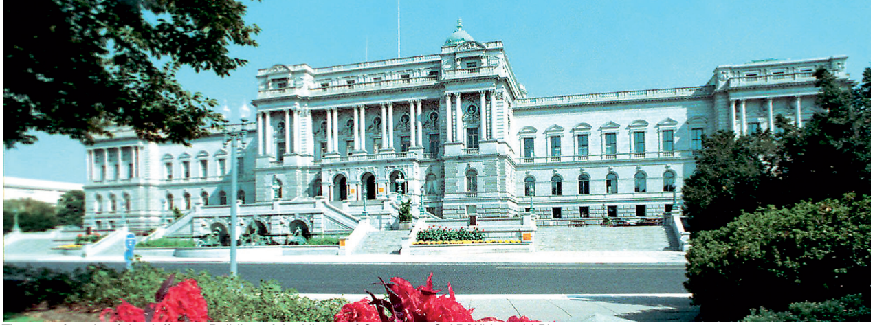
The west facade of the Jefferson Building of the Library of Congress.