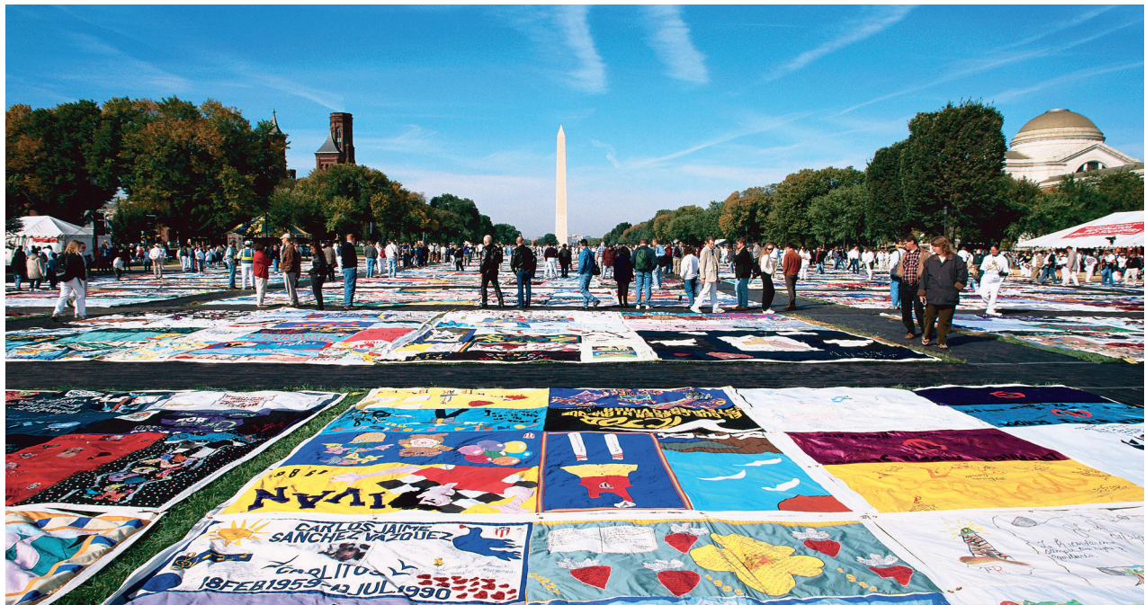
AIDS Memorial Quilt

The AIDS Memorial Quilt, begun in 1987, honors persons who have died of AIDS. Here the quilt is displayed on the National Mall in Washington, D.C., so the public can view it.