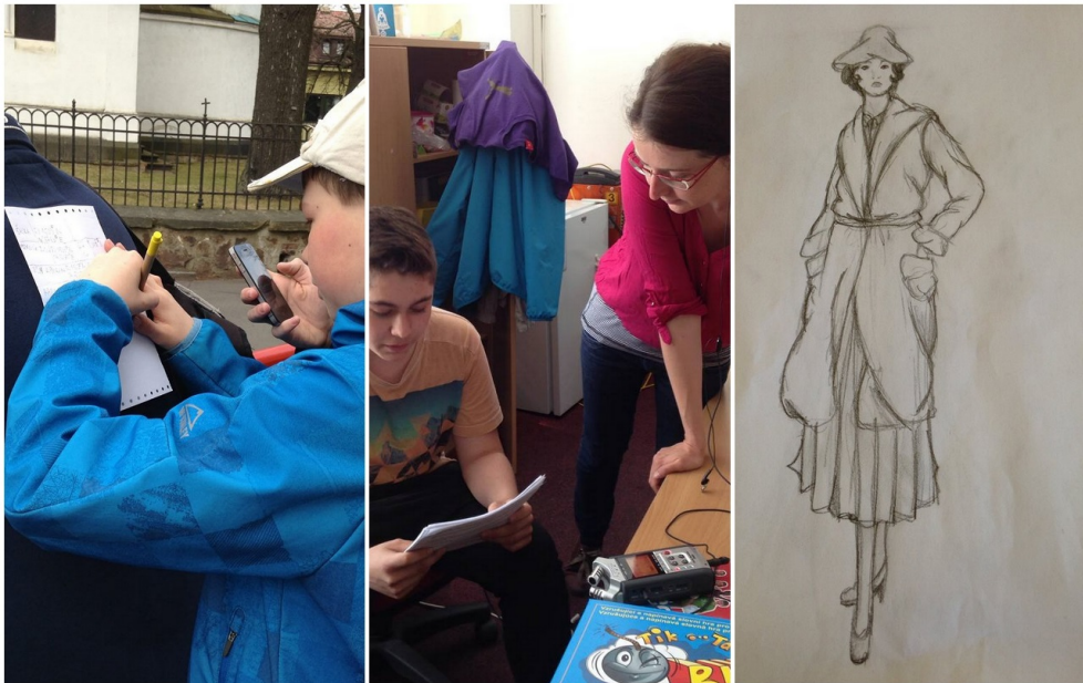
Figure 1. Students' work - locations spotting, recording session and illustrations One teacher from the Edvard Beneš elementary school controlled students' activities between the workshops, motivated them for further activities, supplied them by additional historical sources and supported them through individual consultations

The NGO provided students by final application and implemented students-made content. In the end the 'designers' organized the public release where other students played the game on the school' or their own mobile devices (the game is freely available on Google Play store). The outreach event was a success and was enjoyed by both the community attendees and student participants.