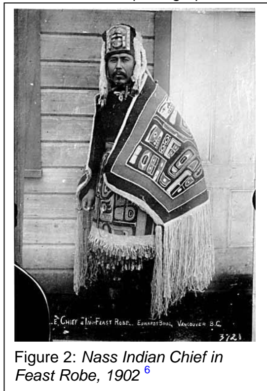
Figure 2: Nass Indian Chief in Feast Robe, 1902 6

The grade 7 lessons in Nationhood/Neighbourhood take on the concepts of exclusion and community-building. Students study both exclusion and activism, as they consider how groups both “fit in” and also “keep out” in order to create both “in” and “out” groups. This is an extremely relevant study for students at a grade level at which bullying and social exclusion are regular parts of social life and an ongoing challenge to students and teachers. The original welcoming stance of the Canadian government towards the Doukhobors from the Soviet Union shifted on divergent cultural norms about the education of children, and a high profile unsolved death in the community. Members of the Doukhobor community in Canada staged many protests (see Figure 3) during this period. The case of the Doukhobors, while a study in that culture, also allows for