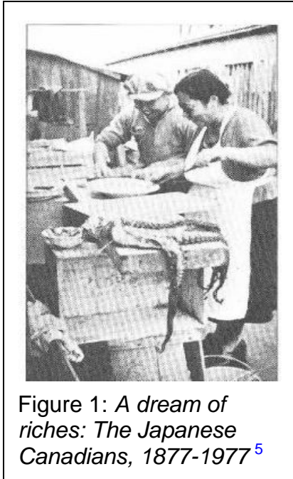
Figure 1: A dream of riches: The Japanese Canadians, 1877-1977 5

collections from the archives such as those of Japanese Canadians taken during the period before internment (see Figure 1) to examine what “neighborly” qualities are in the photographs.