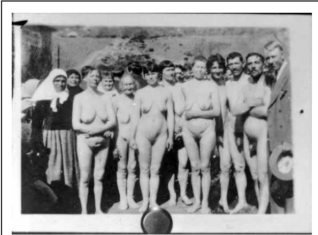
Figure 3: Doukhobor Protest, British Columbia, 1908 7

students to examine protest cultures in general. Under what conditions can communities protest against perceived injustices? What kinds of protests? How are internal conflicts within the group managed?