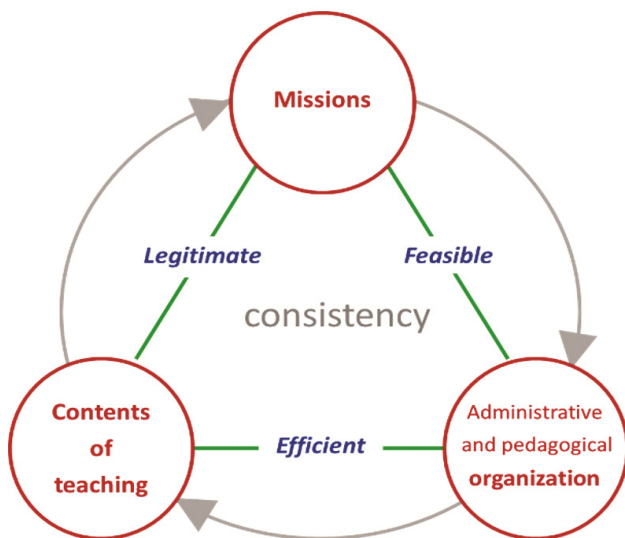
Figure 2. Investigation tool of curriculum

(ii) The survey of C. Hamon about technical education within high school [5] is supported by the investigation tool (Figure 2). It allows to highlight the consistency of a curriculum by focusing on its missions, its administrative and pedagogical organization (school, training and teachers' certification) and its contents (practical tasks, functional analysis, graphics tools, modelling...). This tool also permits to analyze how this curriculum, always is legitimate, feasible and efficient in order to exist and to survive.