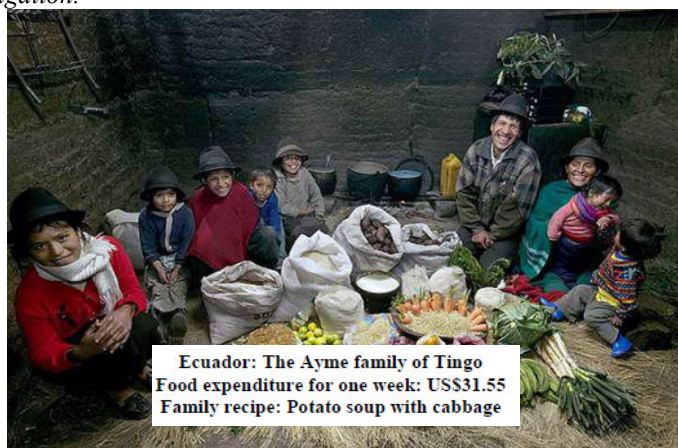
Figure 1. Sample of Lowes (2012) photographs used by Ben's table groups during the social justice investigation.

After some discussion into how the barter system and co-ops work, Ben's table group decided to go to the school canteen to find out how much a can of soft drink could be purchased for and compare the results against supermarket prices. The table groups' investigation revealed that supermarkets can use their buying power to purchase good in bulk cheaper than the school canteen. This conclusion led to several table groups to pose and discuss the question, 'can families from poorer countries also use the barter system and/or co-ops to purchase food'?