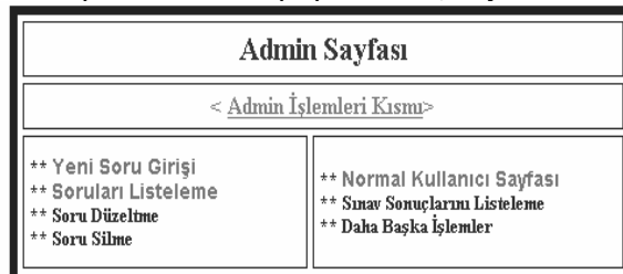
Figure 4 : “Pascal Öğreniyorum” Web Site Teacher Page

Question Entrance: It is the page that teachers enter the multiple choice questions to system.( Figure 5).