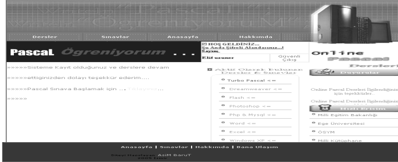
Figure 3 : “Pascal Öğreniyorum” Web site Student Page