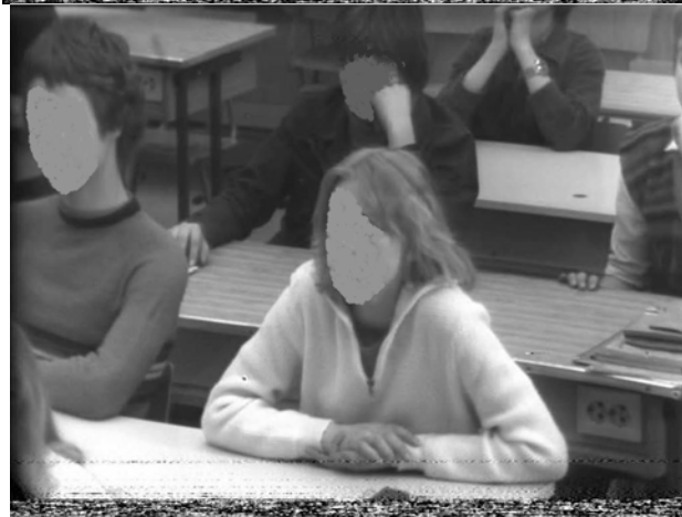
Camera perspectives (from top down): 'class', 'chalkboard', 'partial'