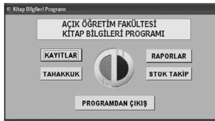
Figure.2 Main Menu

The database is opening with the following start-up menu. The user has the following six main options: creation of necessary records of book's characteristics; control of book storage; preparing royalties and storing personal (authors and publishers) information, and preparing any kind of reports to see information about books. User can quit the database by clicking "Programdan Çıkış" command button (Figure 2).