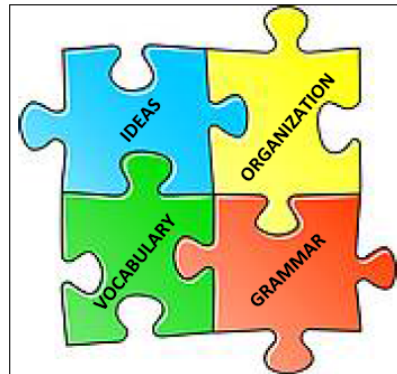
Figure 2. Jigsaw peer feedback

Vietnamese students will participate actively and effectively in peer activities if they feel safe to show their opinions and save face in front of their friends. An overall insight into the jigsaw peer feedback is illustrated in Figure 2, followed by instructions about (1) grouping students in the peer activity and (2) a training session to familiarize students with this feedback approach.