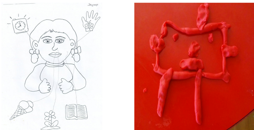
Figure 4. Play dough sample and matching test of one of the students in experimental group

Because the psychomotor skills of the children observed within the study were not developed completely and the children could not do the drawings as desired, the researcher prepared an alternative test as seen in Figure 3 and the students were provided to do this prepared test. In this test which was prepared as cut-and-paste, the researcher cut the organs beforehand and put them in front of the students. And so, the children who could not hold the scissors or was able to hold the scissors but unable to cut properly were also helped. The children pasted the organs placed mixed in front of them into the places where they thought they would fit. Thus, it was tested whether the learning tool place or not. Another test prepared within the study was the matching the objects related to our sense of feeling, and it can be seen in Figure 4 that the children easily did this test.