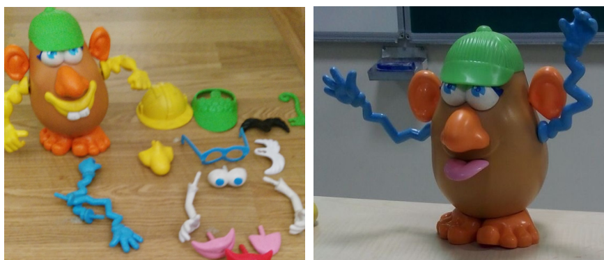
Figure 5. The toy bought by a student in the jigsaw group from his/her home

In addition to that, the children in the jigsaw group brought toys and materials to the classroom and they made effort for their friends to understand better. Example materials are indicated in the figure below.