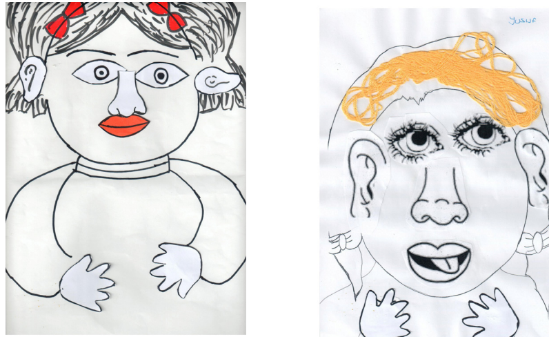
Figure 3. The test based on cut and paste which is used in the study

organs despite non-proportionally. It is thought that the children haven't gained the psychomotor characteristics completely because symmetric characteristics like big-small, up-down were observed in other children's drawings. Thus, the children who could not draw the organs in the same size or proportion were given full grades by the researcher.