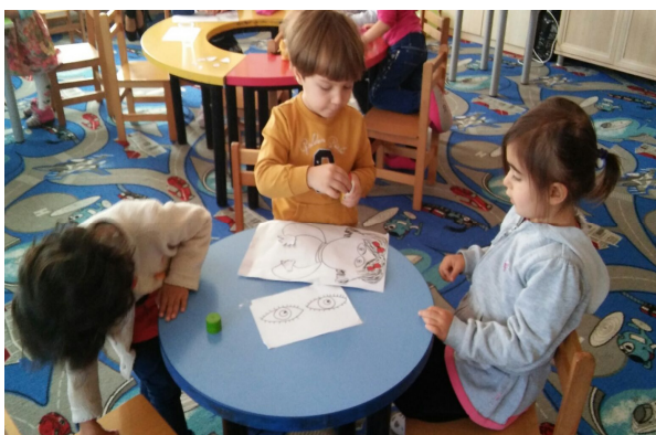
Figure 6. Jigsaw group students

It was determined during the study with the observation of the researcher that a number of social skills were developed in the students on whom the cooperative learning model was implemented, the communication of the students who had difficulty in terms of communication and even introvert students with their friends increased, the sense of responsibility of the students was developed, the children were motivated to actively fulfill their tasks. As a matter of fact, in his study, Avcioğlu (2003) stated that cooperative learning model is effective on the preschool children's learning the listening skills, verbal explanation skills and interpersonal skills. Tarım and Artut (2004) who determined that the cooperative learning model is effective on the students' success and