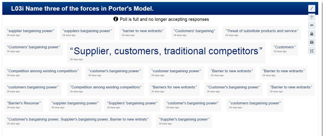
Figure 3: Student responses to the same open-ended question as in Figure 2, but shown as clusters.