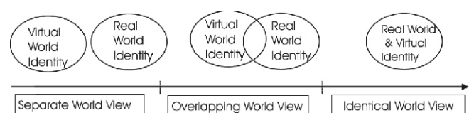
Figure 1. The continuum of worldviews on real world and virtual identities.

Virtual and real world identities are mutually constitutive in MMOG play. As Oblinger (2006) states, gamers must immediately recall prior learning from outside venues - life and school - when participating in an online virtual world. That is to say, gamers draw from their real world identities to adapt to and to succeed in a video game. However, there is a limitation of the transfer of an individual's real world identity to the virtual identity. As Stryker (1980) indicated, the human sense of identity is linked to roles, groups, and society. It is a product and process, as the identity is shaped by the larger society (p. 163). The transfer of virtual and real identities depends on the social identities in the opposing worlds. Returning to the study by