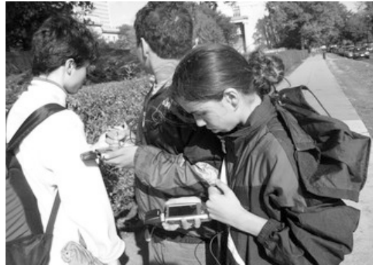
Figure 4. Students participating in the Charles River City Augmented Reality from the MIT website (Massachusetts Institute of Technology, 2008)

These should not be confused with the previously discussed Alternate Reality Games. Augmented reality games (AuRG) combine real world and computer-generated data. The Massachusetts Institute of Technology (MIT) Teacher Education Program has created several educational AuRGs (Massachusetts Institute of Technology, 2008). The lateral thinking involved in designing AuRGs stems from using (i) handheld computers, which are far less expensive than providing laptop computers to students and can provide one-to-one computing, (ii) it allows the designer to leverage the portability of the units and, when equipped with GPS, they provide location to key into data, while (iii) blend nearly cost free real-world activities with low cost technologies for creating content (Muir et al., 2006). Thus, AuRGs take advantage of real-world assets by overlaying the required new reality on top of the existing reality using the technology. Figure 4 shows students using handhelds during an augmented reality game experience.