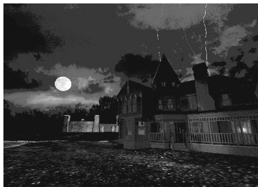
Figure 3. A view of Chalk House within the Created Realities engine.

This seven year-old turn-based strategy simulation game