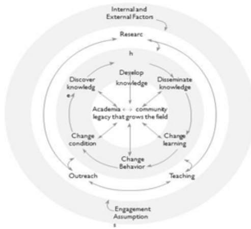
Figure 1. Franz Engaged Scholarship Model

model. The goal of this work was to help academics and administrators better understand and reward wider types of scholarship, in particular scholarship beyond research and teaching ( UniSCOPE Learning Community 2008 ). The three types of scholarship in this model are teaching, research, and service, with discovery at the heart of all three and integration and application woven throughout. The UniSCOPE learning community has created publications and led workshops and dialogue on this model of scholarship. The community feels this effort continues to be a work in progress (2008).