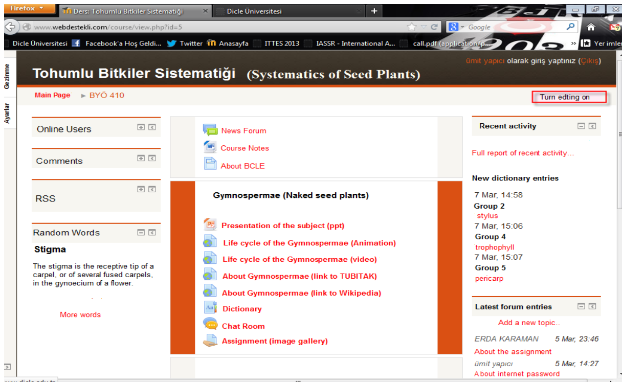
Figure 1. Course screen

The study was performed in the course of "Seed Plants Systematics" in the Spring Term of 2012-2013 and 2013-2014 academic years. The application was applied in four course-hours a week, and the process continued for 15 weeks. In order to shape the online element of BCLE, a website was created using Moodle LMS (figure 1). Also, the Student Team Achievement Division (STAD) technique was used from the cooperative learning techniques. While creating the cooperative learning groups, it was provided to have a heterogenous distribution. For that purpose, based on the students' achievement grades in the fall term course of "Seedless Plants Systematics", the order of students' achievement grades was defined. These grades were consider when determining the members of the groups. In addition, considering the students' gender, they were divided six groups with five students in each. The students were given information about the group rules, and the students were asked to name their groups.