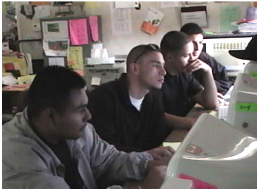
Students uploading their music videos to the Internet

as a media producer in direct communication with others. 3 Young students today are highly motivated to participate in these particular digital art forms that are both "hip" and relevant to their daily lives. Interactive involvement in this arena requires that they learn not only about new kinds of technical tools, but also new forms of digital messaging and response akin to social interaction, digital dialog language skills and emerging dissemination methods. This process is becoming so easy that even very young or challenged students can become immediately enabled to participate in emerging public spaces arising now on Internet, television, mobile devices and more. The goal of the Media Mural project is to exploit these emerging technologies and mass media venues in a way that empowers youth to become thoughtful participants in public media spaces that operate as multi-voiced nexus points for communication.