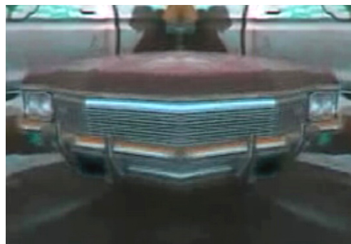
Excerpts from several Media Mural Project videos

Despite the huge learning curve they faced, the videos and original music produced during phase one were good and reflected a wide range of interests. The topics included war and evil behavior; product rip-offs; reasons not to join a gang and why people do; going to jail and dying as the only future for gang bangers;