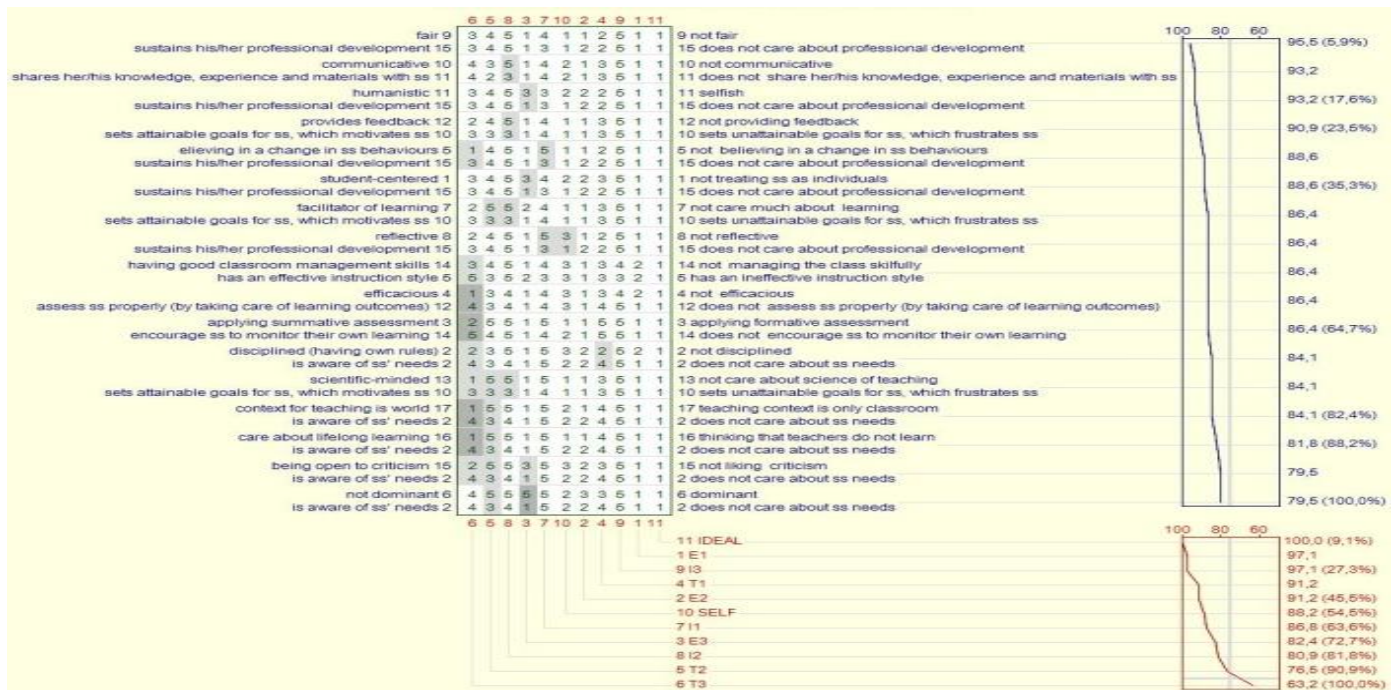
Figure 3. Exchange grid.

significant changes below a horizontal line in the figures. In the exchange analysis, we find that the change in Sinem's views about Typical teacher 3 bears the only significant change in the study and is placed below the horizontal line.