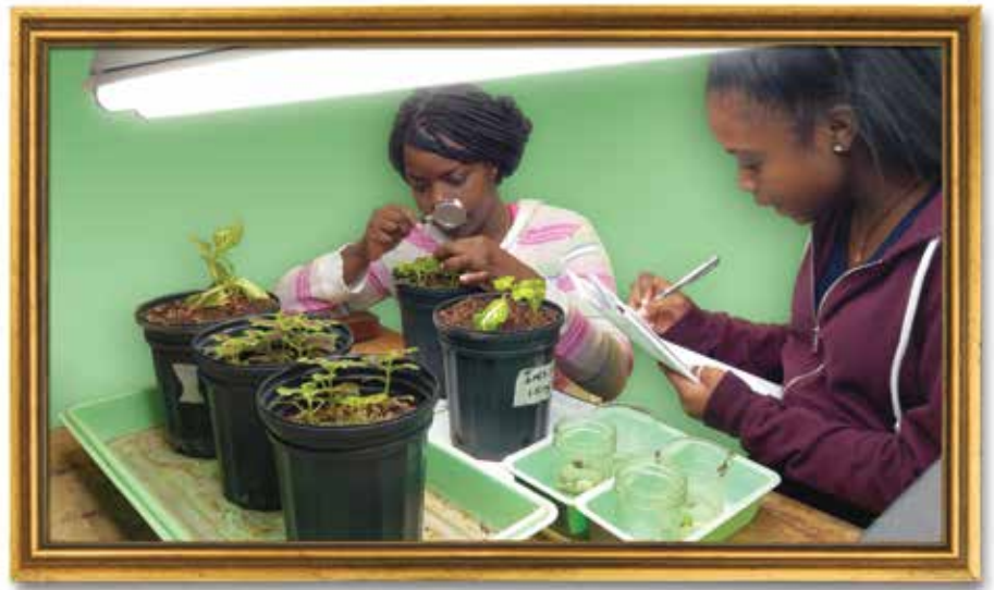
At Urban Academy, student engagement extends beyond textbooks. Above, students collect data for a horticulture class.

Noguera's point is one that the emphasis on testing in the name of high standards tends to miss. Many highly publicized charter schools that tout their test scores are also places where student voice and self-expression are sacrificed in the name of