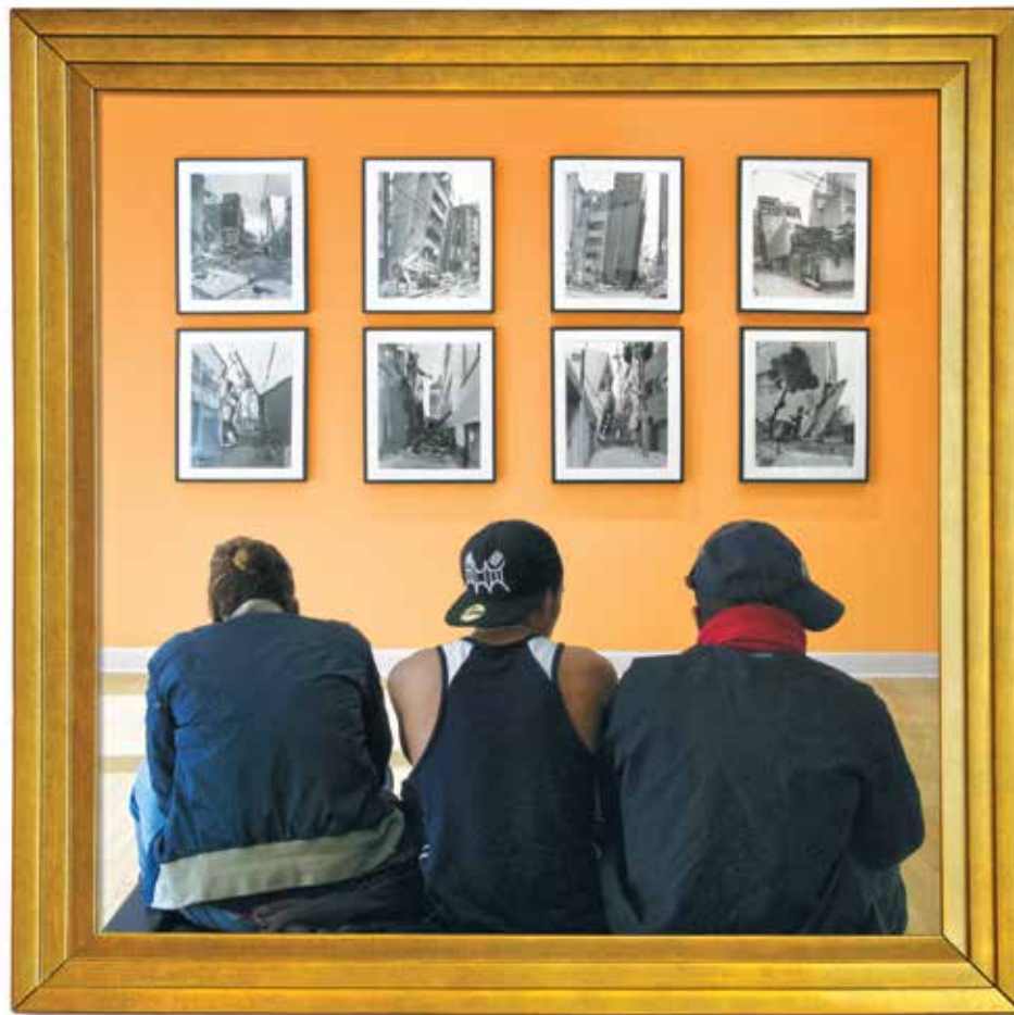
Left, students at New York City's Urban Academy Laboratory High School observe art during a gallery visit.

The Benefits of Performance-Based Assessment