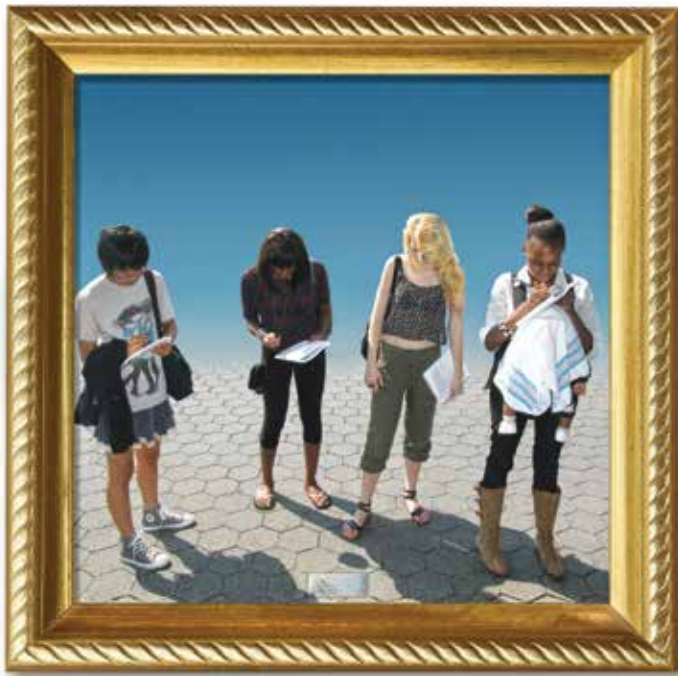
Consortium schools encourage field trips to enhance learning. Left, Urban Academy students inspect sculptures in New York City's Battery Park.

work of locating and presenting additional materials and sources for students' consideration.