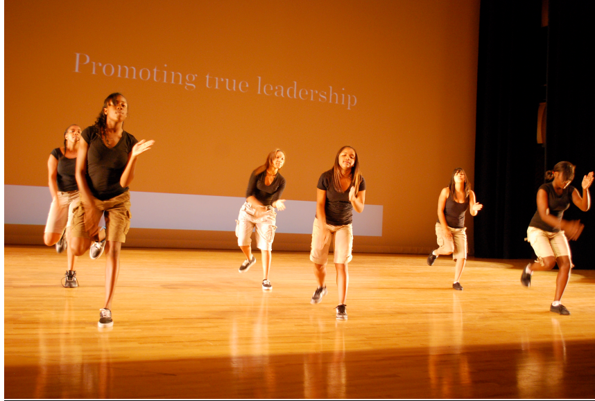
Fig. 3 Centennial High School students perform step dance at UCLA symposium.

What, one might ask, does educational attainment have to do with ArtsBridge? While each ArtsBridge program site is distinctive, every ArtsBridge Program in the University of California system is held accountable to statewide Student Academic Preparation and Education Partnerships (SAPEP) goals. The SAPEP mission is to: