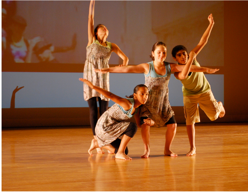
Fig. 4 Gage Middle School students perform modern dance at UCLA Symposium.

In California, the task of credentialing teachers in the approved arts disciplines has primarily been relegated to the California State University system, while research oriented universities have generally steered clear of this issue. However, there is a precedent for inclusion of arts education programs in research universities. For example, reputable research universities--including Harvard University, New York University, and the University of California, Berkeley--have begun to offer graduate degrees in arts education. Of the three aforementioned programs, only New York University offers a useful teaching credential in the arts along with the graduate degree. The flexibility of providing both a graduate degree plus a credential offers graduates greater options to pursue careers as arts administrators, researchers, or classroom teachers.