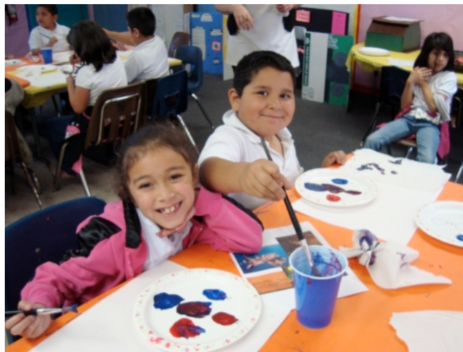
Fig 5 Jefferson Elementary School students study the color wheel and learn to mix colors.