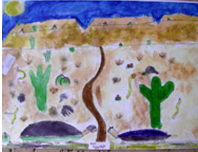
Figure 8. The story “Tortoise Love” included the predator/prey theme.

For the best use of art criterion (extra category provided by the teacher), students chose the illustration, “Life of a Gila (lizard),” because of its unusual frame, use of space, cast shadows, and pattern. (See Figure 9.) Students explained: “Big cactus in front and small one in back; a road getting smaller in the distance; shadows were correct (in proportion to the cactus); and the dirt texture made with a watercolor sponge technique.” Although they couldn’t identify the proper art terminology, students could explain somewhat the realistic spatial factors. Students from ages nine to twelve are in the dawning realism developmental stage are struggling to learn the artistic conventions. Most students in the class were able to portray three different ground areas (fore/middle/back).