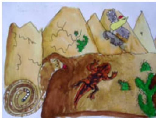
Figure 6. One third of the students used movement in the form of projection (diagonal direction).

The goriest story was the students' next category selection with some evidence of expression/projection . Some boys (30%) enjoyed writing about violent details. For instance, "Hawk (Sheriff of the Sonoran Desert) and Eagle (his sidekick) investigate a crime against voles by snakes...so we flew down and tried to kill them (snakes). But Eagle got his jugular tore open and bled to death"[RJP]. Gory details, inspired by popular films, seem to interest males at this stage. Most students indicated countless action in their stories, yet in their illustrations only 33% of the students used movement, mostly in the form of projection (diagonal direction, such as limbs, open mouths, and eye direction). (See Figure 6.)