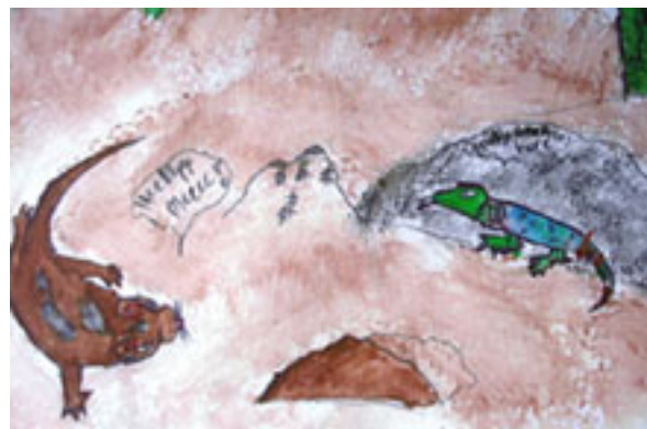
Figure 4. Close-up view featured the words, “Heellpp Meeeee!” The artwork also featured a mouse running to hide under a rock drawn from the aerial view.

In a third example, House Mouse Sue “longed for adventure...got out, met a (collared lizard) friend Boomer, and gets chased by hawk. She cried, ‘Heellpp Meeeee!’ Boomer responded, ‘Quickly, come over here’ (to hide behind a rock).” (See Figure 4.)