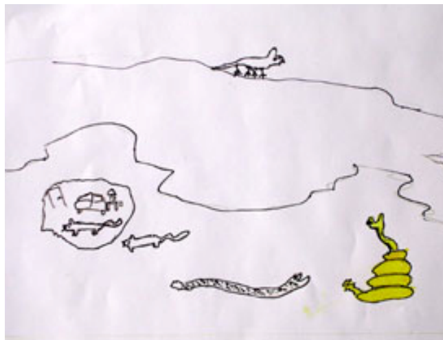
Figure 10. Students noted hidden details, such as the underground rats hiding in their burrow.

What details are hidden in the artworks? Mary asked this question during her observations of students when they were judging their classmates' drawings. She noticed that male students tended to draw small details for added suspense to a story. For example, several students hovered around the illustration, "Crackdown 2000. "They noted hidden details, such as the underground rats (voles) in their burrow (See Figure 10).