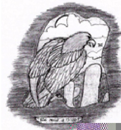
Figure 2. Student valued his preliminary hawk drawing, because he felt that he had messed up his painting.

Barbara provided a wide selection of books with photographs and illustrations of birds and animals for students' research. She shared information on the flora and fauna in the Sonoran Desert from websites ( http://www.cabezaprieta.org ; http://www.arizonensis.org/sonoran ). Information included diet, habitat, and predators. She supplied step-by-step examples of how to draw birds and animals and had students make practice sketches concentrating on the contour shapes of the creatures and noting scientific details. One female, for example, drew sketches of desert skinks with unusual feet, small lizards from the book Snakes and Lizards (Golden Junior Guide). The researchers were not aware of this type of lizard. A second student preferred his preliminary hawk drawing with its various feathered textures (Figure 2) more than his final painting because he felt that he "messed up" his painting. Students seemed to appreciate the practice sketching and helpful directions. The researchers incorporated students' drawing choices into our findings.