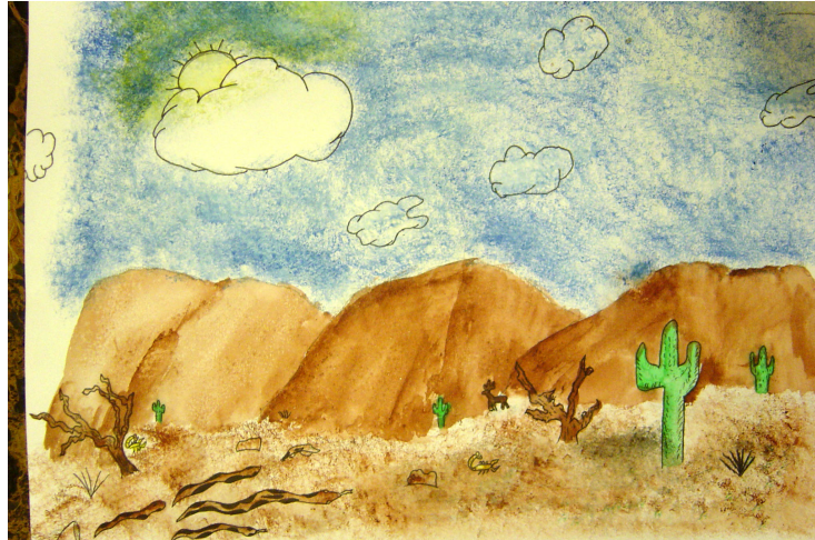
Figure 3. The Snake Family

The most creative story was “The Mojave Rattlesnake,” because the author “strung out” the words. The story has strong use of (first) person and incorporates environmental information. This rendition features creative spelling to heighten emotions. The scenario unfolded: wood rat and woodpecker are playing together. Gila monster threatens to eat them, chases them, and they get away. Snake said, “I sssaw yyou two getting away.... So I like to sssssee if youuu can get awayyy from meeeee. I like to chasssse my foood before I eeat it” [sic]. Jackrabbit became involved in the chase, snake ended up accidentally biting a cactus, and “rattlesnake didn’t eat solid food for seven years.” The pack rat and woodpecker were safe again. In a second story, rattlesnake explains, “We [my friends] all go out slithering together Friday night. We like to pick on birds. When we shed our skin its kind of like a birthday party.” The creative use of words-- repeating letters to stretch the anguish and using colorful action words, such as slithering --is amazing for seventh and eight graders.