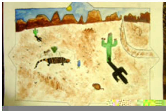
Figure 9. This illustration also featured extra spatial accomplishments, such as cast shadows, a road getting smaller in the distance, and unusual framing.

For the best use of art criterion (extra category provided by the teacher), students chose the illustration, “Life of a Gila (lizard),” because of its unusual frame, use of space, cast shadows, and pattern. (See Figure 9.) Students explained: “Big cactus in front and small one in back; a road getting smaller in the distance; shadows were correct (in proportion to the cactus); and the dirt texture made with a watercolor sponge technique.” Although they couldn’t identify the proper art terminology, students could explain somewhat the realistic spatial factors. Students from ages nine to twelve are in the dawning realism developmental stage are struggling to learn the artistic conventions. Most students in the class were able to portray three different ground areas (fore/middle/back).