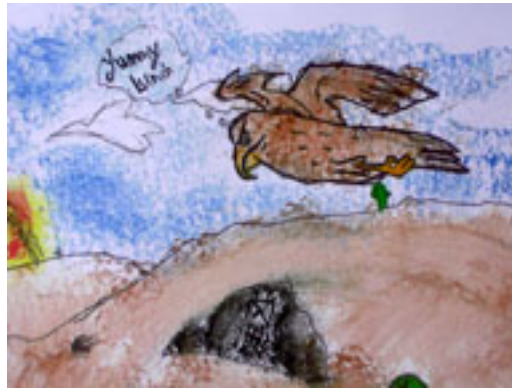
Figure 5. "Yummy Lunch!"

Students' choice of "the funniest" stories included clever punch lines, such as "I hate fast food!" In another example, "Crackdown 2000," one boy commented, "Rats!" (Double meaning, rats as subject matter and frustration remark). In a third example, Gila monster boasts, "I must say it was a very good feast with a side of ants." Finally, one student (MR) wrote, "Yummy Lunch!" in a cartoon bubble in her drawing. (See this close-up in Figure 5.)