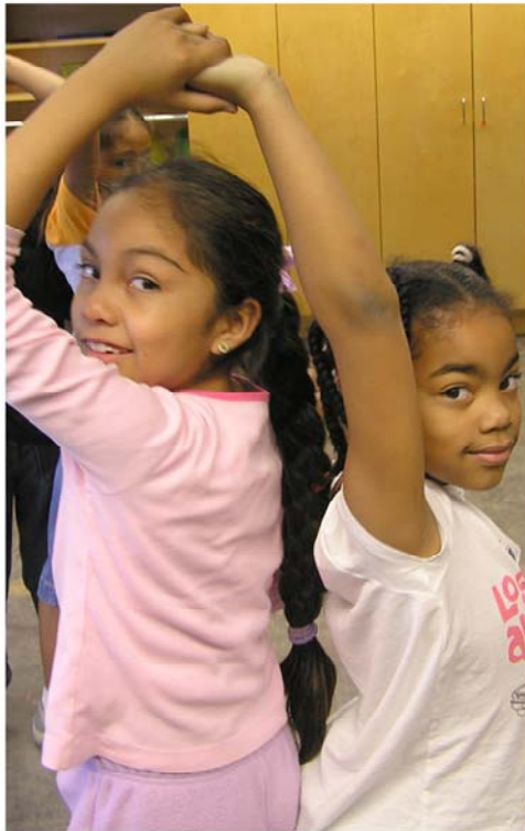
15: Freese students dancing "Verbs."

visiting artist, there's not really any kind of problem. Everybody wants to be involved and participate. Usually, behavior issues don't arise. Kids don't act up because they want to be there. It's not, 'This is too hard for me so, instead, I'll act out.' It's enjoyable and fun. So, I think that kind of reels them back into school for awhile."