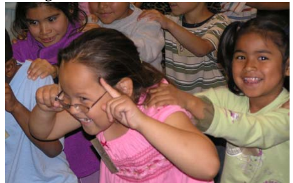
13: Freese Kindergarten Cooperation Conga Line: Body Movement Theater Warm Up

During the school year, each Freese teacher has four arts rotations and spends two months (eight sessions) working with an artist on a specific project before moving to another artist and art form. Earlier, the benefits that a puppetry lesson on “Three Billy Goats Gruff” had for English language learners were discussed. However, little was said about the benefits that such a lesson had for the class as a whole. A first grade teacher recalled that same production: