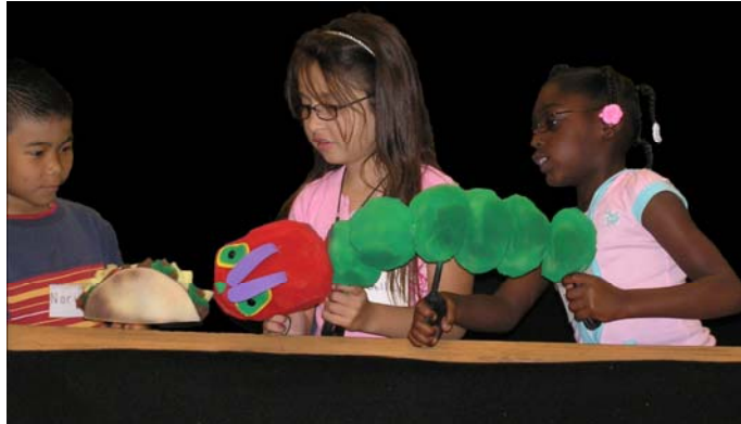
7: Freese Kindergarteners learning to perform Eric Carle's "Very Hungry Caterpillar"

In some of the arts classes, English and Spanish were used side by side. In one kindergarten music class, the teaching artist began by singing "La Sorpresa", then drew pictures on chart paper, as he explained, in English, what happened in the song. That way, whether the