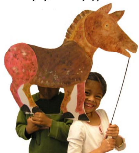
11: "Neigh, neigh!" ... "Want to go for a ride?" said the horse to the spider, as Freese kindergarteners perform "Very Busy Spider."

When the children sit down on the carpet again, the teaching artist brings out the puppets, one at a time. Student(s) are chosen to manipulate each puppet, walking it around the circle, working on movement and cooperation