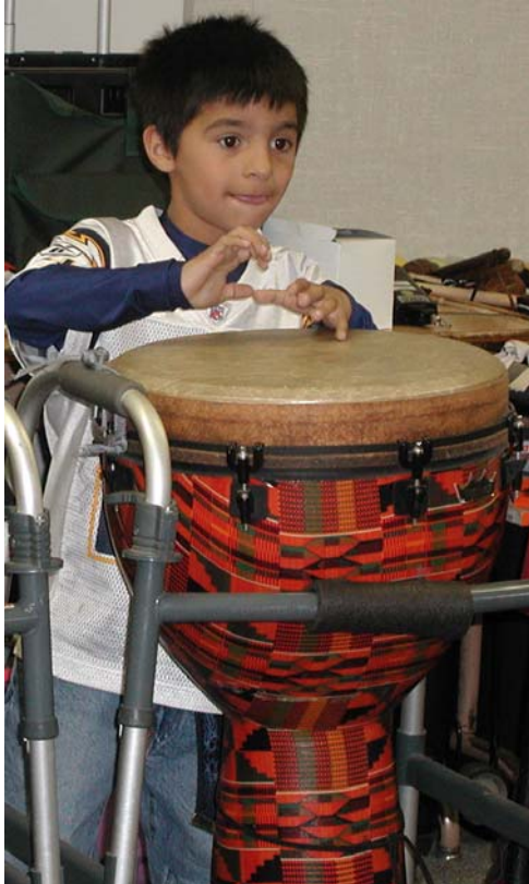
1: Second grade student at Freese Elementary, learning drumming and percussion.

The U.S.-Mexico Border Region, as defined by the 1983 La Paz Agreement, is the area within 100 kilometers (about 62.5 miles) on either side of the international border. Extending 1,952 miles, from the Gulf of Mexico to the Pacific Ocean, this region has in recent years been subject to explosive population growth (from 6.9 million in 1980 to 13 million in 2005). News reports focusing on this area have tended to emphasize the political and environmental challenges associated with rapid demographic and economic change. However, there are success stories as well. This article focuses on Freese Elementary School, where the Mapping the Beat lessons sponsored by National Geographic were first implemented. This is a school that has used the arts to create many bridges among ethnic groups in a volatile corner of San Diego.