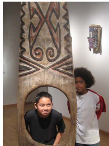
12: Freese students at Mingei International Museum.

Since the teachers at Freese were not trained arts specialists, the arts lessons were delivered by teaching artists from the community. The teaching artists collaborated with classroom teachers to plan arts lessons that linked to lessons in other content areas. At the time that the magnet program was getting started, the San Diego school district was focusing strongly on raising test scores. Schools were discouraged from taking field trips. Freese, with its arts and culture magnet program, was one of the few San Diego schools able to actively partner with arts organizations. This gave rise to many opportunities to collaborate with organizations such as the San Diego State Theatre Department, the San Diego Guild of