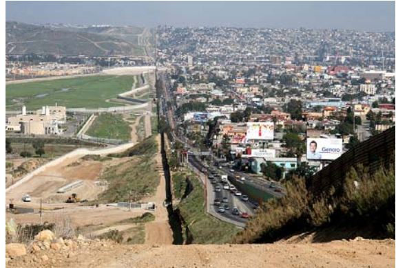
18: View of US/Mexican border divide.