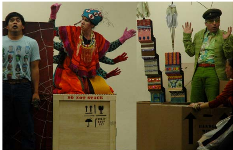
3: La Jolla Playhouse Student Pop Tour performing at Freese Elementary in San Diego, California.

This article looks at a cultural arts magnet school that has focused steadily on imparting such intellective competencies to students living in a diverse community only 20 minutes by car from the United States-Mexico border. Located in the southeastern corner of the San Diego Unified School District, Freese Elementary was not only the first school to implement the Mapping the Beat curriculum after it was funded by a grant from National Geographic, but it has continued to pursue arts integration across all grade levels through its Cultural Arts Magnet Program, building a vibrant school culture in a turbulent neighborhood.