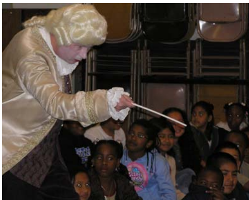
5: Mainly Mozart Assembly at Freese Elementary.

This situation is especially problematic for children who speak a language other than English at home. When young English learners first enter a traditional U.S. public school, they attempt to use their home language to communicate with teachers and peers (Saville-Troike 1987; Tabors 1997). Gradually, the children realize they are not being understood. At this point, a shift occurs. The child begins to actively attend to the new language (Ervin-Tripp 1974; Hakuta 1987, Itoh and Hatch 1978; Tabors 1997). At this stage, the child will attempt to communicate nonverbally, using gestures and facial expressions. A third stage occurs when the child masters the rhythm and the intonation of English, as well as some key phrases (Tabors 1997). In the fourth stage, the child learns vocabulary and moves into productive language use; children express themselves by using their own words (Tabors 1997). At this stage, the child demonstrates a general understanding of the rules of English and applies them more accurately.