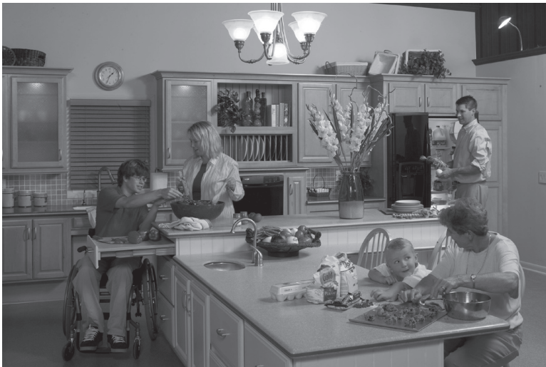
Figure 2. Model kitchen photo from Creative Ideas Magazine

about price and installation from project staff. In the first year this exhibit was open (2005), nearly three thousand people visited the site over a three-day period.