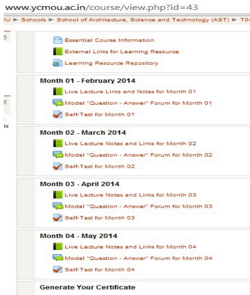
Figure: 2 Course Webpage

In a face-to-face classroom, a learning community gets developed when Teacher actively interacts and engage students. The same type of intellectual and personal bonds happens in an online setting only if Teacher who shows their presence multiple times in a week, and at best, daily.