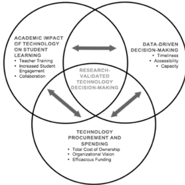
Figure 1. Theoretical Framework of Technology Decision-Making.