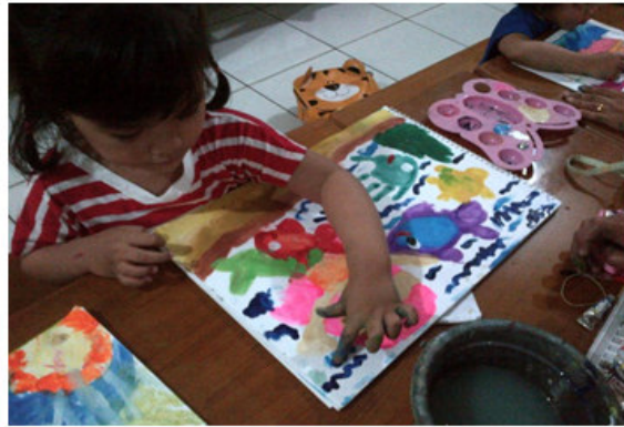
Figure 7, 8. Coloring Stage