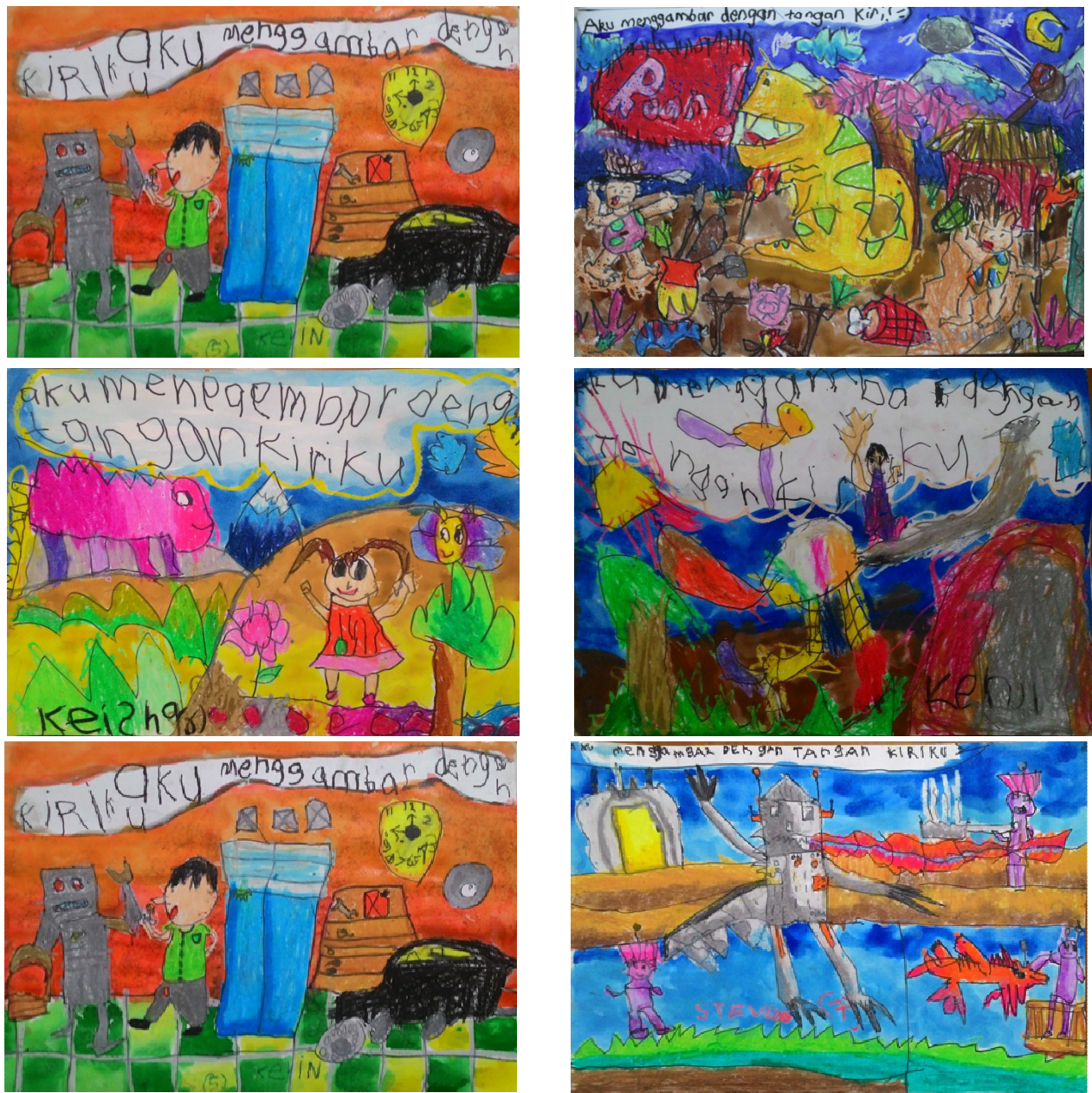
Figure 13, 14, 15, 16, 17, 18. Drawing Results