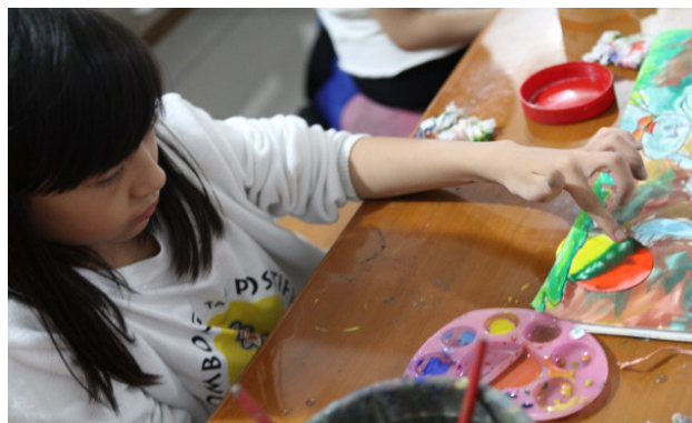
Figure 12. Coloring Stage