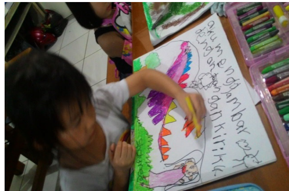
Figure 9,10. Coloring Stage