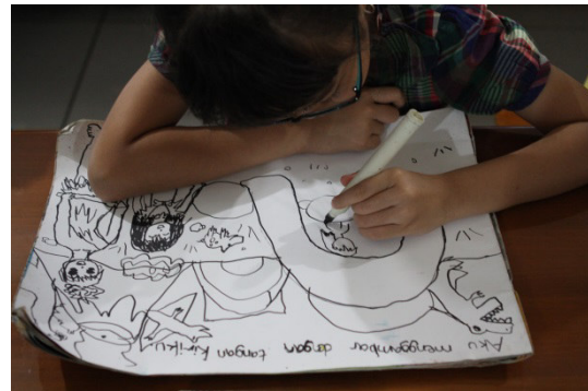
Figure 1, 2. Experiment drawing with left hand