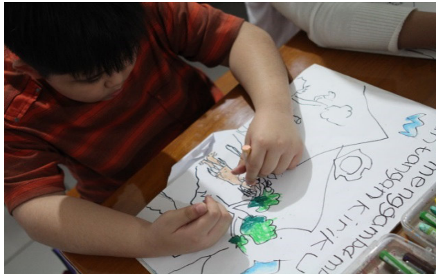
Figure 11. Coloring Stage