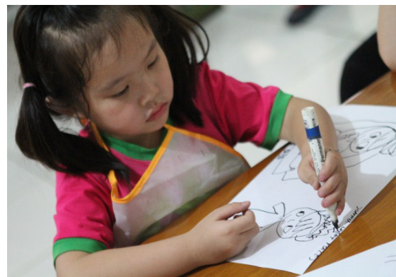
Figure 5,6. Experiment drawing with another left hand