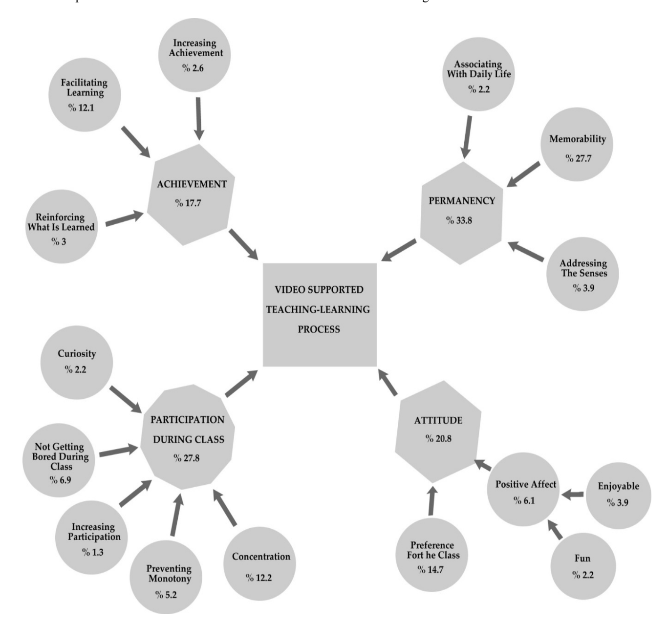
Figure 1. Percentage values of themes and code titles related to student views on teaching-learning process enriched by video clips

climate/environment". Lesson environment code has also sub codes titled "enjoyment and fun/entertainment". Permanency theme has four sub titles called "memorability", "observation (concretization)", "associating with daily life" and "addressing the senses".