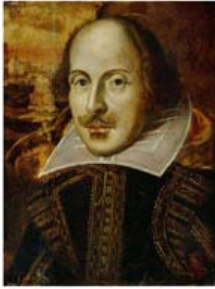
Figure 1: Example stimulus, task ten

At the start of the session the participants were asked about prior experiences with online library catalogues including Bibsys Ask. All ten tasks were completed in one session, and there was no dialogue between the participants and the experimenter besides responses to questions initiated by the participants. The students were allowed to use external online resources as supplementary aids if needed e.g. checking the spelling of a word. They were asked to comment on their search behaviour during debriefing where unusual behaviour had been observed.