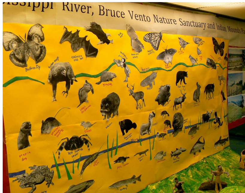
Figure 12. River-related animal and insect cutouts.

up images. Our group also spent time searching online for photos and information on the animal species that occupy the water, the land and the skies of this area. As a quick method to learn about this aspect of the environment, students printed the images, cut them out and arranged them on a piece of mural paper with animal names, to be included in our display (Figure 12).