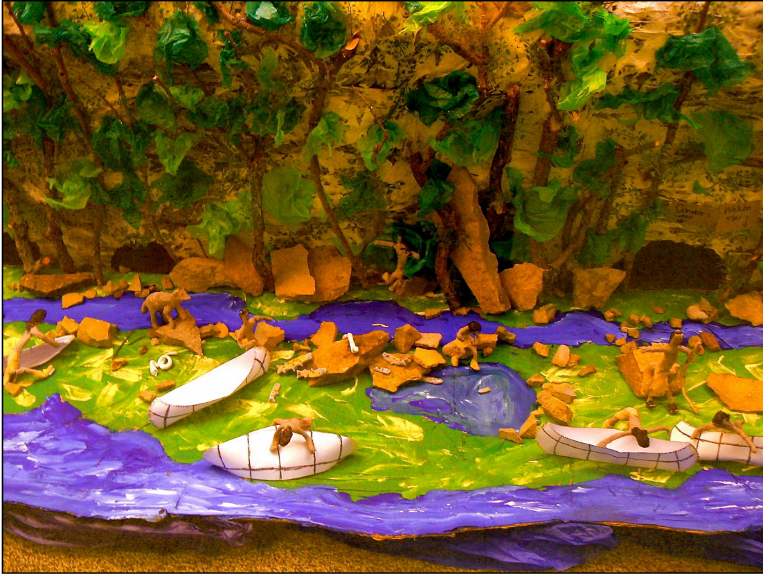
Figure 4. Display with lower bluff, caves, Mississippi River, figures and canoes.