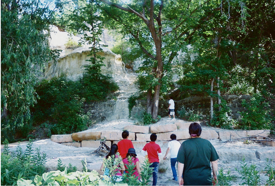
Figure 10. Exploring the bluffs.