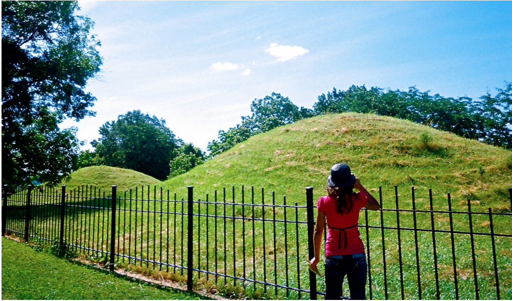
Figure 9. Student photographing the mounds.

Essential class reading was about two groups who settled in Minnesota (a word from the Dakota translating as “ sky-tinted-water ”, Peacock & Day, 2000, p. 137). The Dakotas are believed to have arrived very early, sometime after the glaciers receded. The Anishinabe arrived much more recently, in the early 1700’s (Whispering Wind, 2000; Boszhardt, 1998). Until the Federal government imposed assimilation policies beginning in 1887 (Peacock & Day, 2000), these groups lived in communities of between 300-400 members. Both groups “relied extensively on the forests, rivers and lakes for food, materials for clothing, tools, housing and transportation.” (p.149). Community members harvested grains, trapped, hunted and fished all through the year. The Dakotas and Anishinabe generally got along with each other. In their early days, “[these]...American Indians did not pursue technological advances, or the domination of the land, choosing instead to live a spiritual existence in harmony with nature” (p. 150).