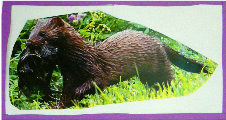
Figure 7. Focus and Frame exercise. (Student work, photo by author, 2011).

looking through the camera lens. To support curriculum understanding and for viewing practice, the first art activity we did was to select images from magazines, including people, objects and nature, then framing them on paper (Figure 7).