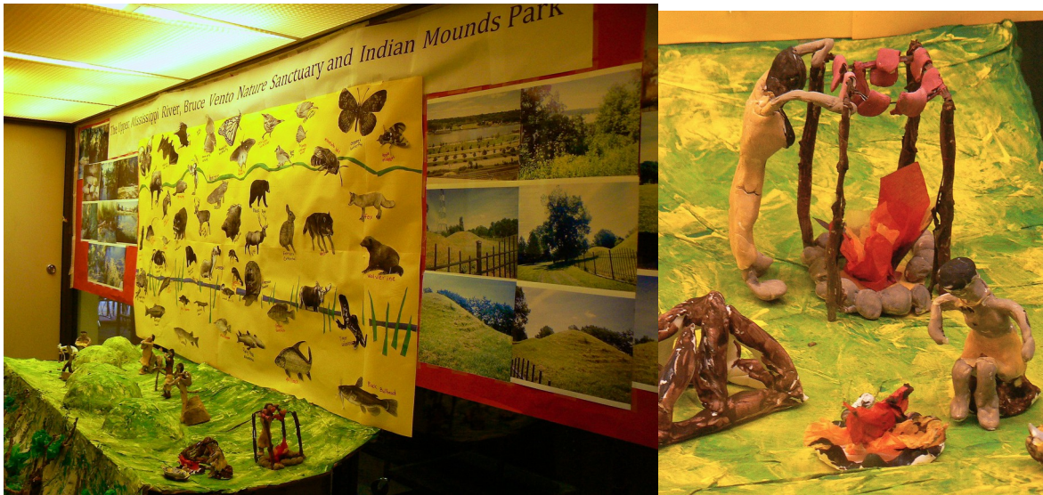
Figure 15. (Left) display case with student work: photos, animal printouts, mounds, figures and related artifacts. (Right) detail of figures drying meat on a rack and cooking next to a fire.