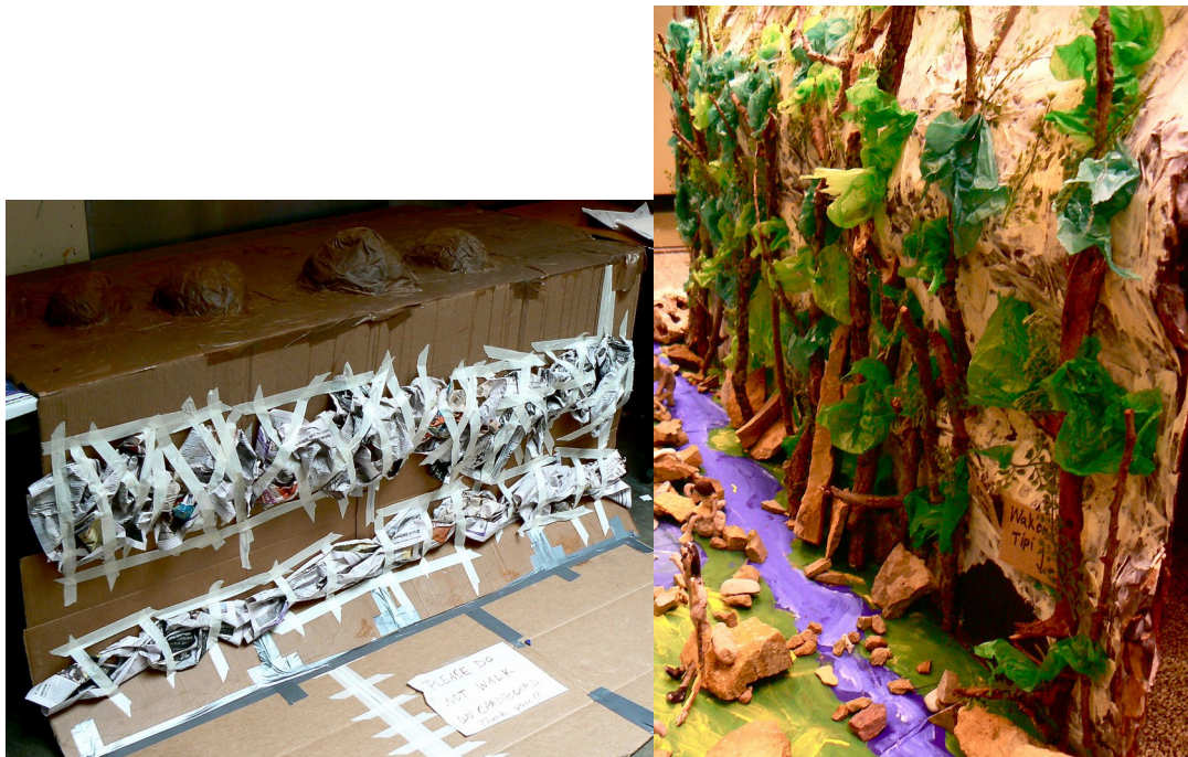
Figure 13. (Left) cardboard structure for bluffs. (Right), detail of completed bluff with rocks, sticks, tissue paper, paint & paper mache.

made of paper, clothing, bows and arrows, and other related items. 4 The completed 3D artwork, animal printouts and photographs were organized by myself and some of the students, in a large glass case inside the school, on display for the entire fall, spring and summer semesters of 2011-2012 (Figures 14 & 15).