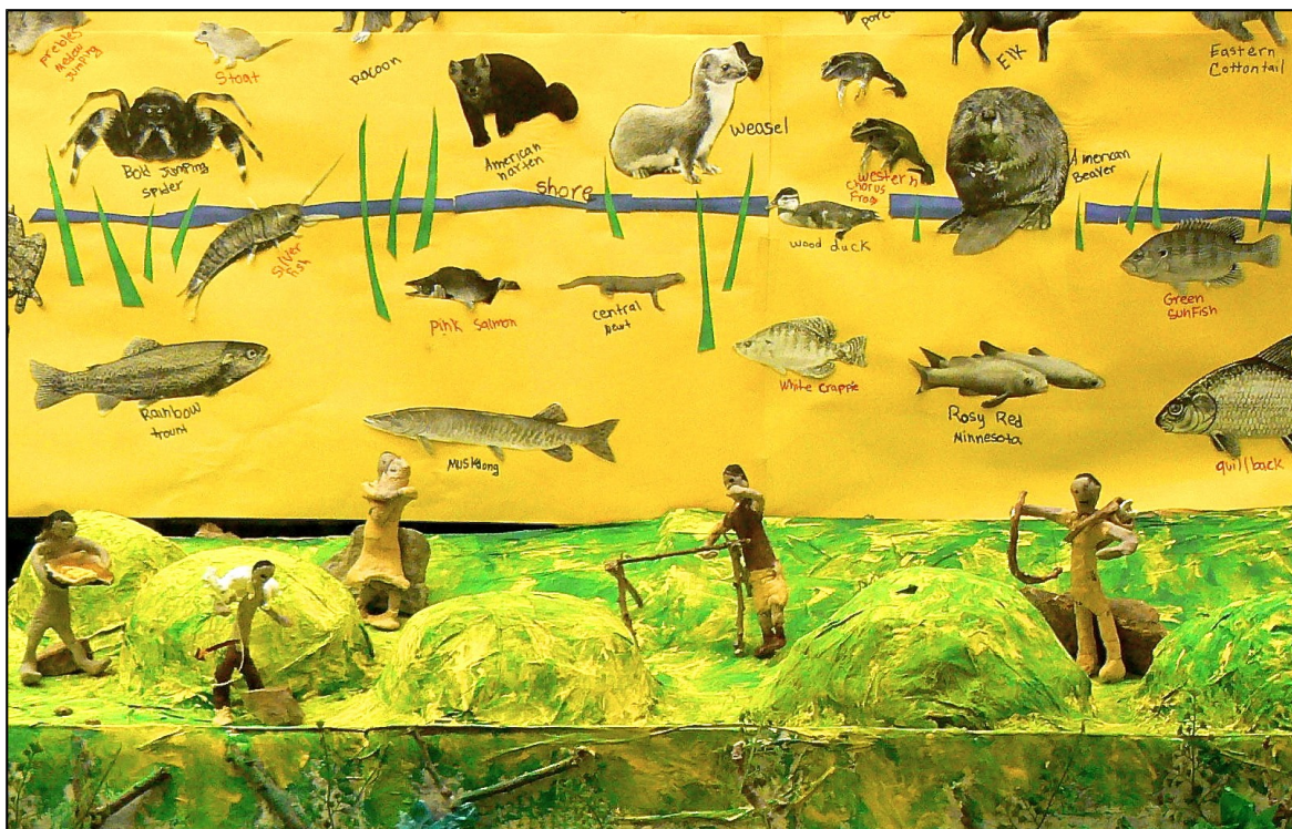
Figure 3. Final display with effigy mounds and figures, upper bluff.

photos of students' work at the end of the class day, when projects were complete and during our field trips at the Science Museum, the Minneapolis Art Institute, Indian Mounds Park and Mississippi River Bluffs. I collected students' individual artwork and writing, and extensively documented the collaborative display, which culminated the project. This display remained intact the entire 2011-2012 school year. It was a mixed-media representation of the Mississippi River Bluffs and effigy Mounds, including landforms, figures and artifacts (Figures 3 & 4). The figures represented two Native American groups - the Anishinabe (Ojibwe) and Dakotas (Sioux), who had immigrated up the river to this location, and still live in various parts of Minnesota (Peacock & Day, 2000; White, B.M., 1992). The characters in the display are depicted conducting daily activities in their early settlement years, on top of the bluffs and on the river's banks.