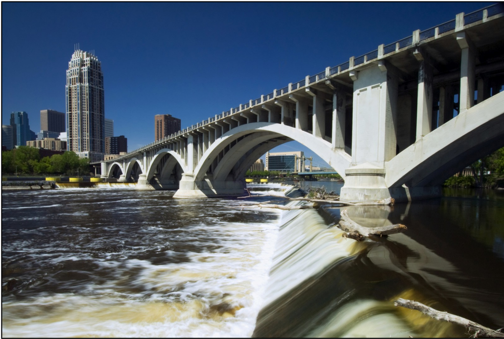
Figure 2. Upper Mississippi River, view from the east bank, just above St. Anthony Falls, Minneapolis, MN.