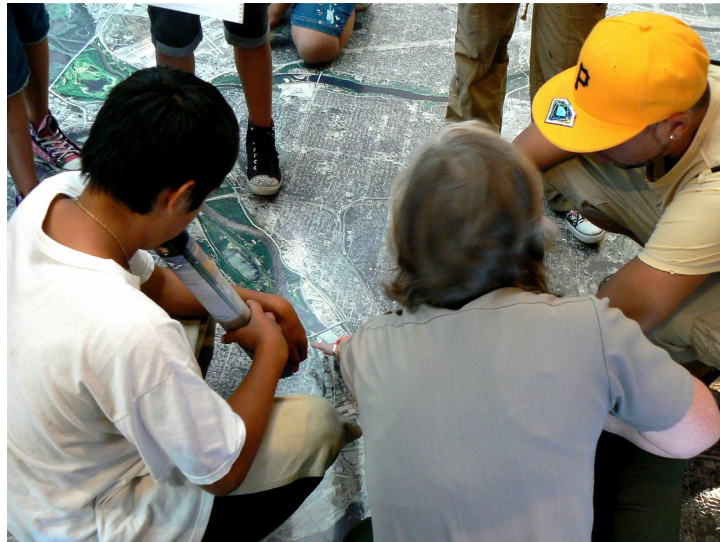
Figure 11. Examining a floor map of the Mississippi River at the science museum. (Photo by author, 2011.)