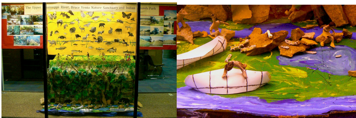
Figure 14. (Left) completed display case with student photos, animal mural and sculpture of mounds and bluff. (Right) detail of river at bottom of the bluff with figures tending canoes and fishing.