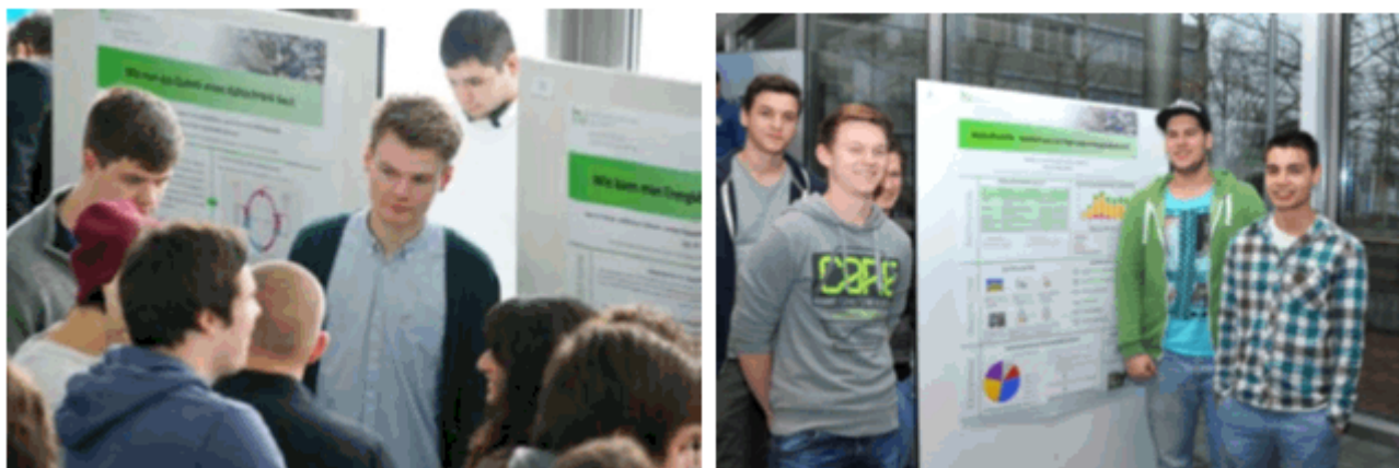
Figure 2. Poster presentation with nearly 40 groups resulting from the introductory course

The Bachelor program for both directions comprises 7 semesters study, including a plant design project, an industrial internship and Bachelor thesis as final project qualifying for direct access to industry or continuation in his Master study. Our sophisticated Bachelor program provides students all necessary knowledge and skills to work as an engineer in the biochemical or in the chemical industry and related sectors like pharma, food or energy (Tab. 1). The students acquire a broad knowledge in chemistry and biotechnology, mechanical and process engineering, as well as process safety understanding. Also courses in Business Economics and Technical English are included.