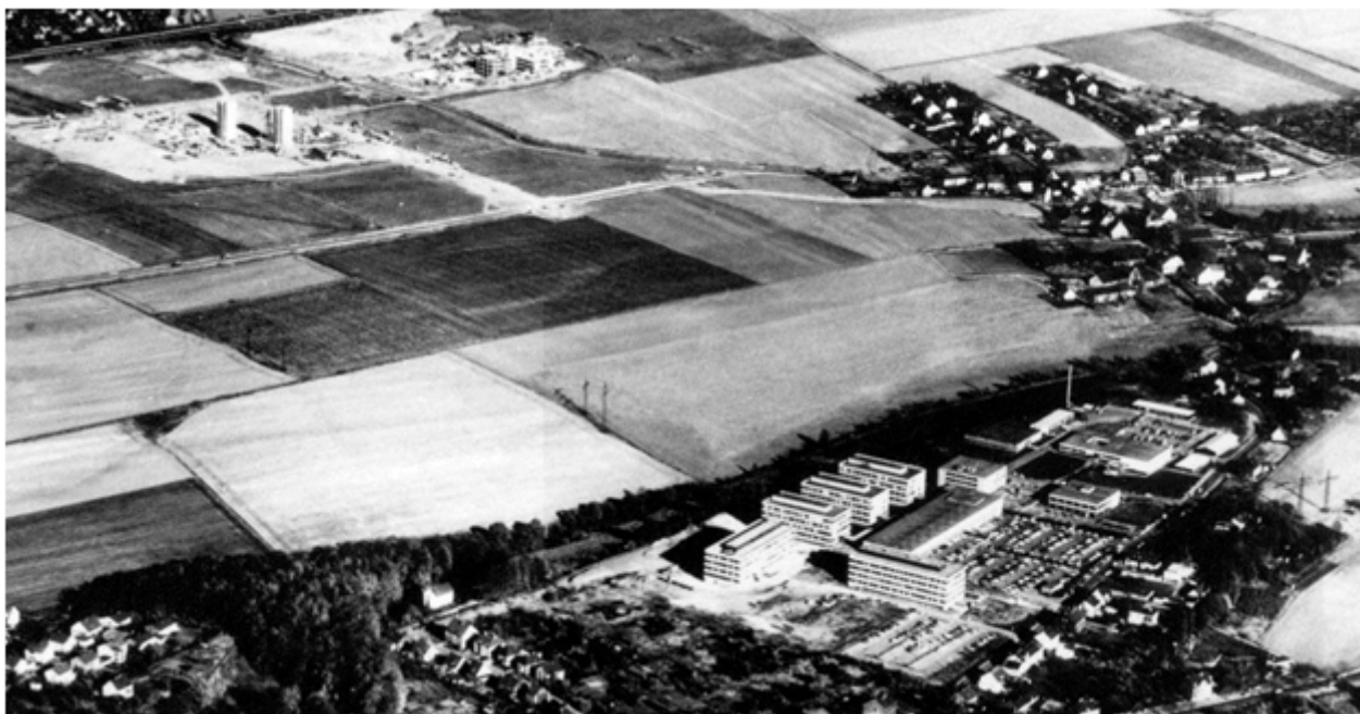
Figure 1. Campus from 1971 showing the first nucleus in the front with modern tall buildings and the construction site of the North Campus with buildings for Chemical Technology in the upper left corner [6].

The department takes a particular pride in its high number of female students of approximately 35 % on average, and in 2001 the faculty happily welcomed Gabriele Sadowski as first female professor. Moreover, the department is also a truly international one: To open it to students from abroad and implement modern BSc (7 semesters) and MSc (3 semesters) curricula English language programs and courses were introduced. More than 170 students graduated in this teaching programme of Process Systems Engineering with only courses in English.