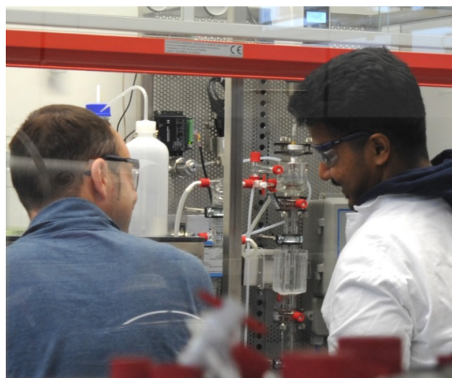
Figure 4. Graduate students in the laboratory working on a miniaturized stirred column for extraction experiments

Pharmaceutical Engineering, Process Design, Process Performance Engineering and elective classes as well as successful completion of a Master thesis. We offer students to work on their Master thesis also in labs of accredited partner universities. With their degree in Biochemical Engineering Masters the students have acquired a well-founded scientific knowledge and appropriated and state-of-the-art methods for a multitude of various engineering tasks.