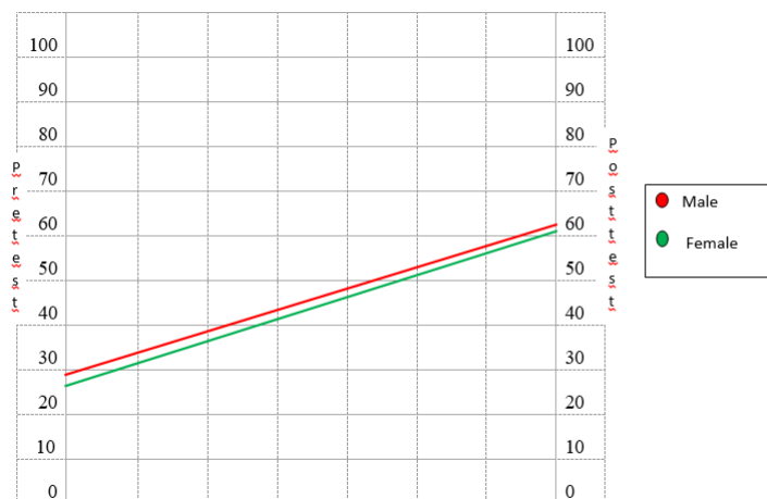
Figure 2. Performances of male and female students’ taught using PPT

Hypothesis Three: There is no significant difference in the mean achievement scores of high, medium and low achiever students using PowerPoint Presentation.