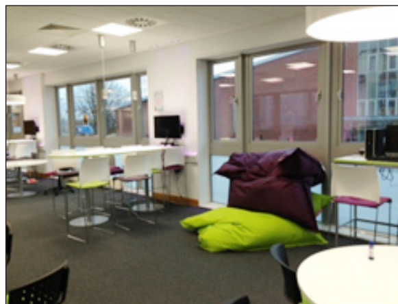
Photo 4: An open learning room (known within the student cohorts as the 'Facebook' room).

Photo 4 shows a recently created space in one of the buildings used for teaching. It quickly gained the name of "Facebook room" amongst the students themselves due to a perception of the use of the room. The colours, relaxing furniture and seating arrangements all gained comments from the students in the study. These comments were largely positive but some negative comments included a dislike of the noise and consequent impossibility of working alone. This photo provided the richest opportunity for scrutinising any potential "gap" between students' preferences for suitable learning environments and the university's conceptualisation of their needs. It will be interesting to maintain an evaluative eye on how uses of space evolve