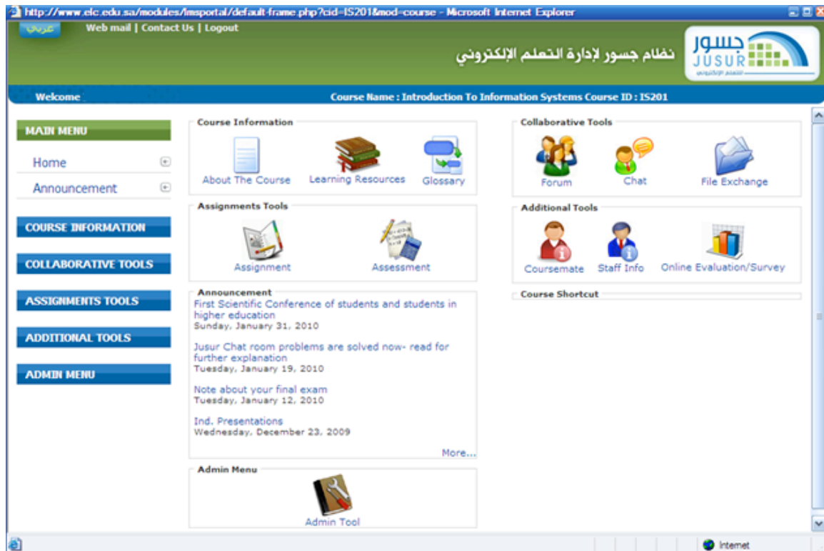
Figure 1. JUSUR main features

This study was conducted to evaluate the level of satisfaction of the students and the corresponding instructor after using JUSUR as a way to deliver e-learning. This LMS includes five main functions as illustrated in Figure 1: Course Information, Collaborative Tools, Assignments Tools, Additional Tools and Admin Tool. These features were always active throughout the semester.