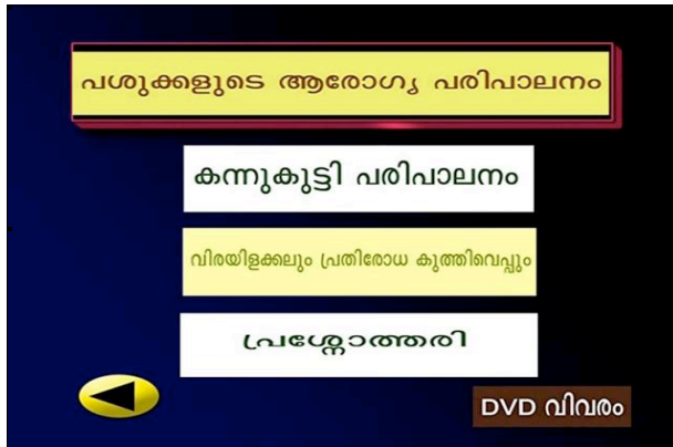
Figure 2: Second page of the main menu