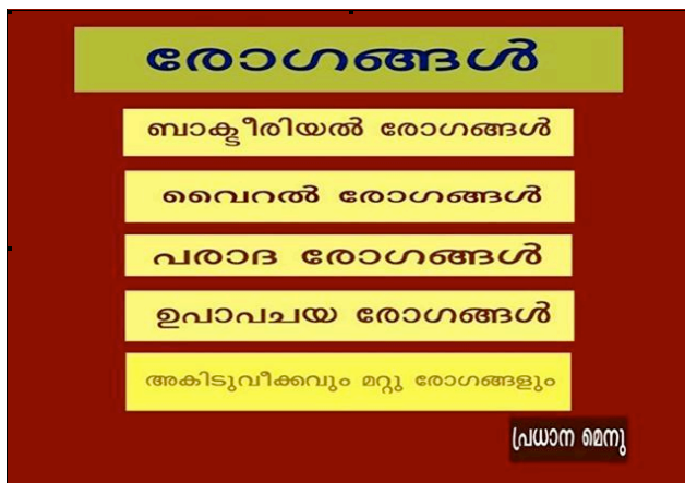
Figure 3: Submenu on “diseases” chapter

The quiz section was essentially designed as a menu page for each of the ten questions with three alternative answers. Selection of one of the answer would lead to a title page where the answer selected was either shown right or wrong as the case may be (Figure 4). The ten questions were linked linearly and on the last question a link to main menu was designed. This quiz section was essentially designed to help the learners of the interactive video - DVD to evaluate themselves.