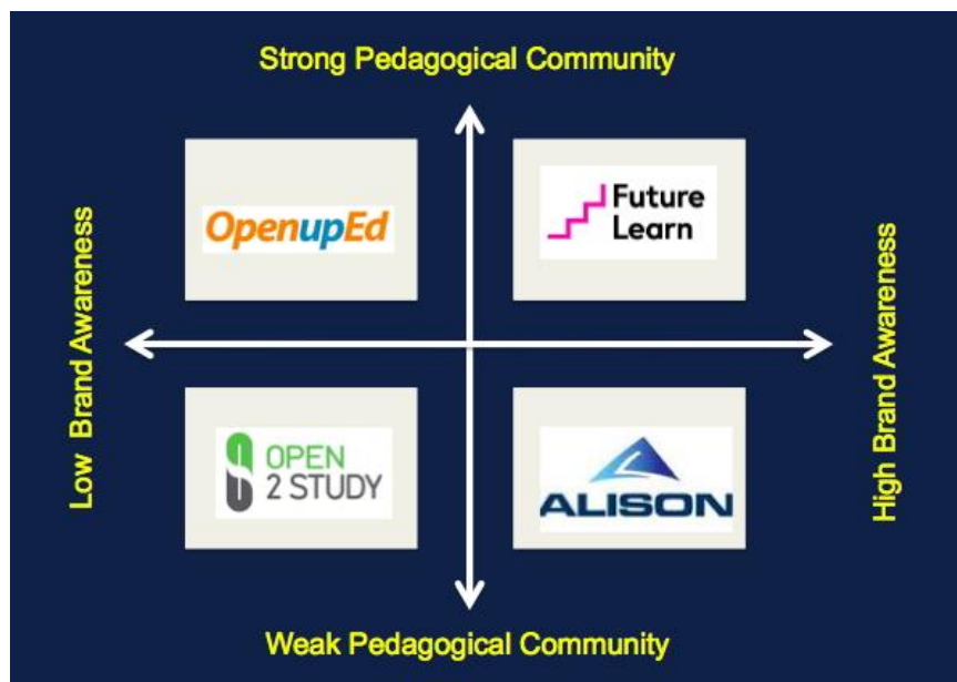
Figure 3: Example decision plot

In a similar vein, we have generated valuable dialogue and matured our thinking by plotting different MOOC options on a chart in order to highlight key differences where the x and y axis represent specific variables. For example, Figure 3 depicts the differences we perceive between four different MOOC options according to brand awareness ( x ) and strength of pedagogical community ( y ). The figure below shows FutureLearn in the most desirable top right quadrant with both high brand awareness and a strong pedagogical community supporting future development. Of course, this assessment reflects a European bias as FutureLearn has yet to establish a major foothold in North America. In the case of Open2Study, the bottom left quadrant reflects the fact that this MOOC is very much an Australasian initiative but the position could change in the future. Importantly, the relative position of the MOOC platforms changes depending on the variables, especially if you select the cost of the option compared to brand awareness or the ability to make local customisations compared to the strength of the pedagogical community.