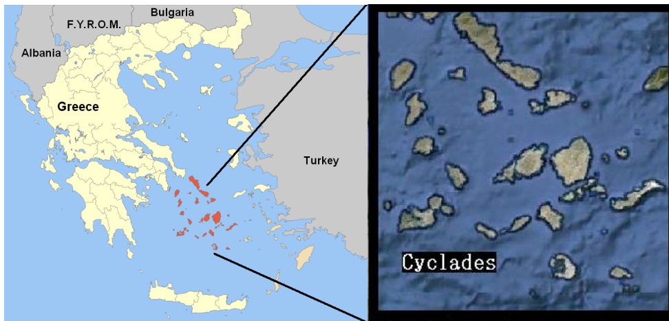
Figure 1: The Cyclades Complex of Islands

Cyclades complex of islands is a region in the Aegean Sea (figure 1). These islands are well known tourist destinations. Although, in the summer all these small islands are crowded, in other seasons most of them are neglected. These islands, due to inaccessibility and isolation they face several difficulties; one of the most important is the lack of educational services.