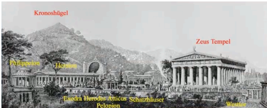
Figure 3: A snapshot from the Educational Webcast

In order to examine the above objectives an experiment with real classroom conditions is conducted. Firstly, six small schools with two teachers each one were chosen. Following, the investigation was specified in the fourth grade in the course of history. Subsequently, the educational webcast (Figure 3) based on the curriculum of the ministry of education (Greek Pedagogical Institute, 2010) in the section of “The ties that bind the Greeks” was developed. In particular that section describes all the historical cultural events that bind the Greeks (i.e. Olympic Games, Amphictyonies). Furthermore, the teachers create a test similar to the previous ordinary tests (in terms of the type and the size of exercises), in order to measure the effectiveness of the webcast.